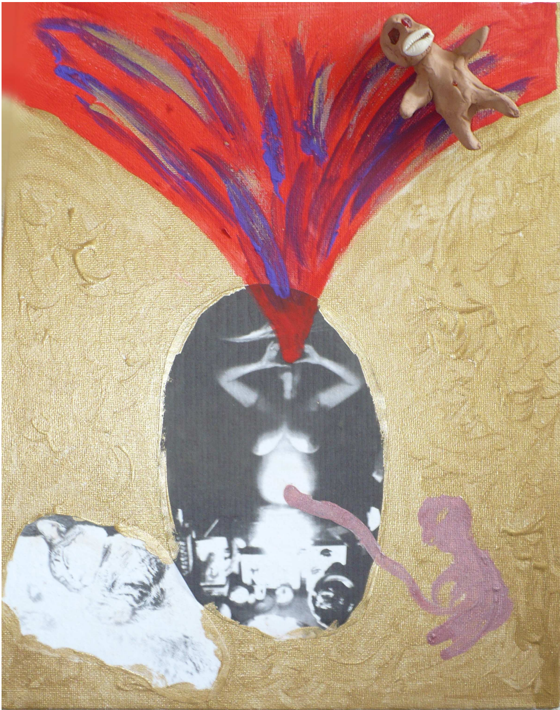
Figure 11: May's dream image