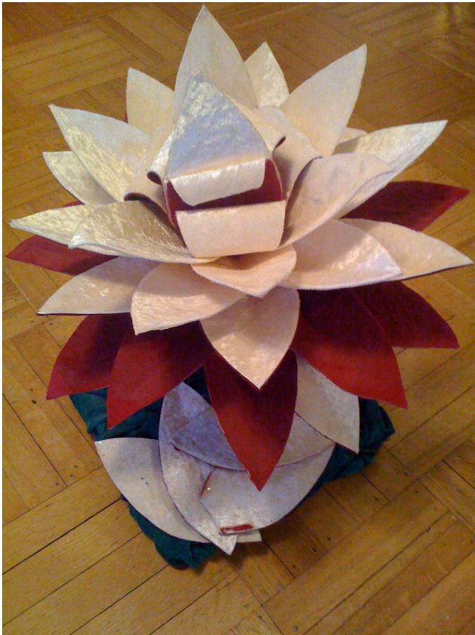
Becoming 2" x 1.5" " paper and fabric