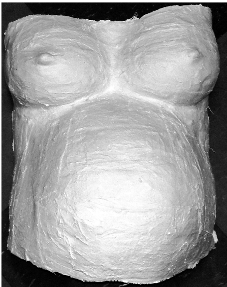
Figure 3: Gabrielle and Ulysses' body cast

During the process Lyle noticed that all the women were resting and allowing their husbands to create the cast except me, I was helping create my own cast. He complained that I was not allowing him to nurture me. I wondered