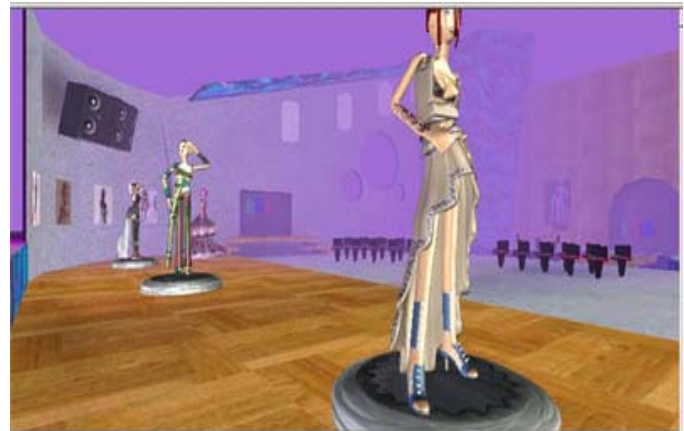
Figure 1. One of several 3D 'virtual fashion-cyber mystery show' spaces, here before the virtual crowds arrived. These models "wearing" original fashion designs are click-able, revealing additional 3D galleries of the designers' work.

Nowhere is this clearer than in the modern classroom, where both students and faculty need new conceptual frameworks and collaborative systems that leverage the strengths and benefits of the digital age. Today's educational system adapts too slowly, if at all, to the rapidly-changing economic realities of the increasingly digital marketplace. Students need new methods and strategies for development of skills and systems that bridge the gap between schoolwork and professional work and make them viable in the digital marketplace. Educational institutions must envision and define a wholly new pedagogy for the digital age. Educators must function as digital facilitators, not merely information providers. This new teaching and learning model, developed in and facilitated by digital data delivery formats, must be fast, flexible and fun if it is to compete in the digital landscape. It must be virtual, visual, collaborative, iterative and emergent.