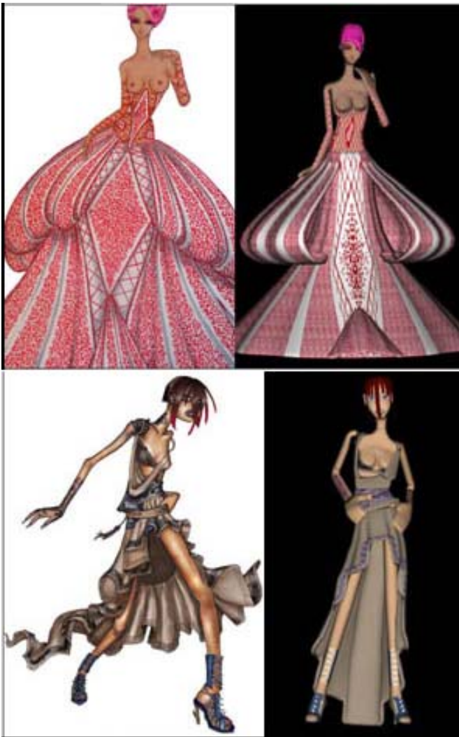
Figure 2. Collaboratively created cyber-fashion show: Original design sketches (white background) from FIT fashion designers are turned into 3D avatar models (black background) by SFU students via an iterative process - all using distance collaborative tools between two coasts and countries.

The overall project goal was to explore how online collaboration systems and virtual environments can be used practically for distance learning, fashion and virtual worlds design, development of new marketing tools including virtual portfolios, and creation of cross cultural online/physical events. The result of this process was an interdisciplinary, cross-institutional, international effort in collaborative design in virtual environments, and a successful exercise in emergent, collaborative distance learning.