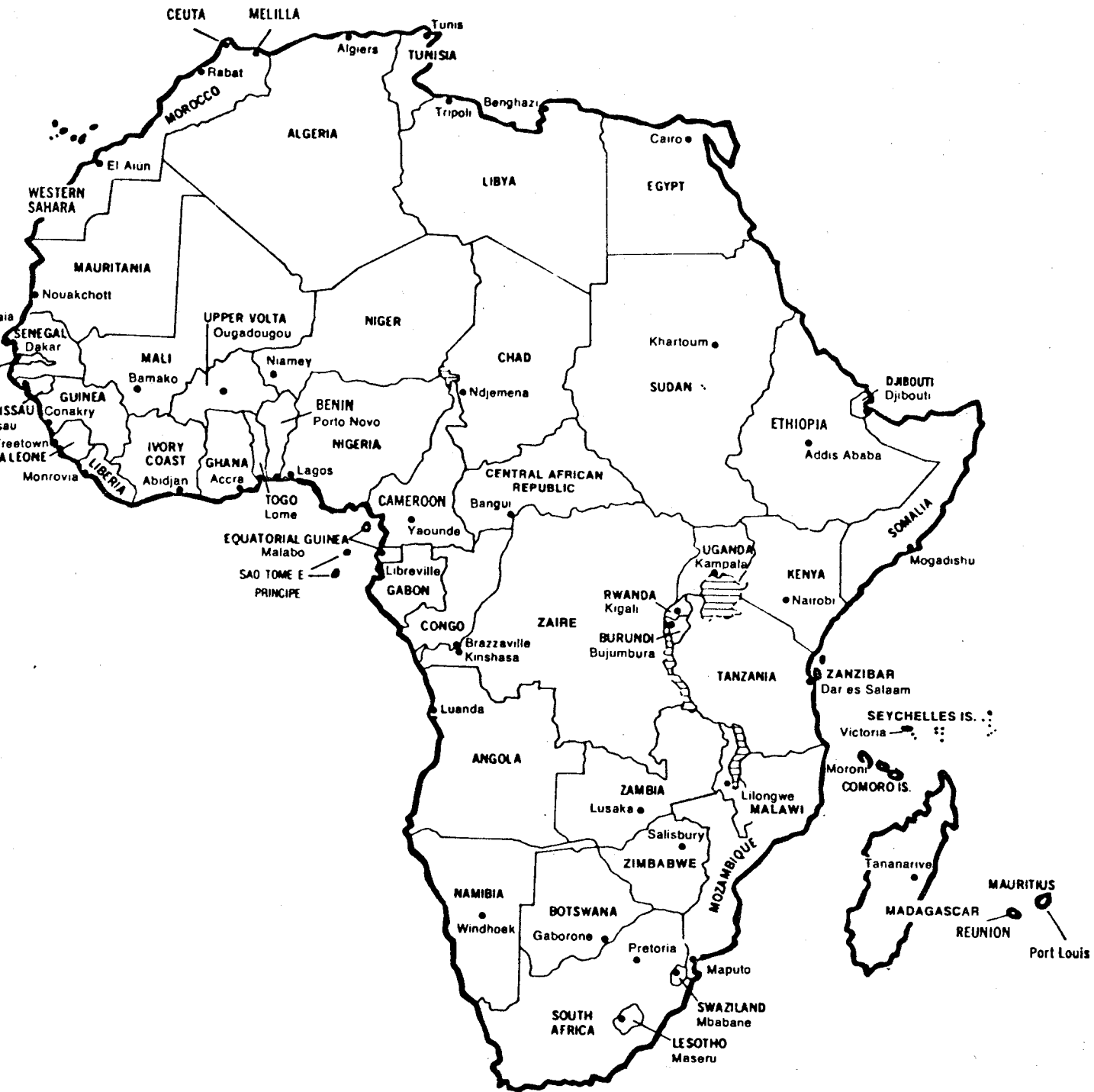
Map of Post-Colonial Africa showing Boundaries Inherited by the New Nations at Independence.