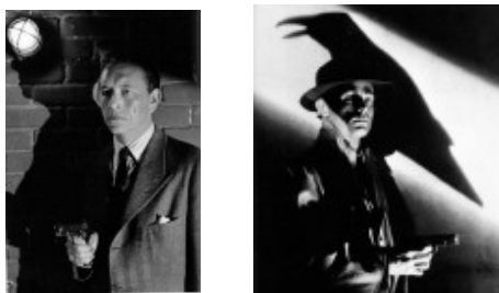
Figure 2. Film Noir uses contrasts and shadows

In addition to color and brightness contrast, filmmakers also used affinity of color, e.g. affinity of high saturated warm colors or unsaturated cold colors in one shot [4-11]. An example movie that extensively used this technique is The Cook, the thief, his wife, and her lover . Other examples include The English Patient , which used affinity of de-saturated colors, and Equilibrium , which used affinity of cold unsaturated colors.