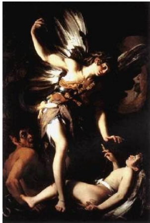
Figure 1. Chiaroscuro Technique used in Sacred love versus profane love Painting

These kinds of patterns are usually used in peak moments within a movie, such as turning points. Lower contrast compositions often precede these heightened shots, thus developing another form of contrast, contrast between shots.