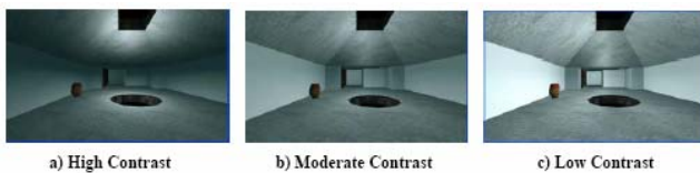
Figure 4. Linearly increasing brightness contrast (where center of room is the focus)

Two prototypes were created for this system. The first prototype was developed to test the representation of patterns and their integration within ELE. For this purpose, the author created an interactive 3D environment using WildTangent, a publicly available web-based game engine; the environment is shown in figure 4. The task of the user was to navigate through the environment. The lighting conditions were varied as a function of time. The figure shows three screenshots taken at various times during the interaction. The lighting system was configured to use pattern IX, where brightness contrast subjected was decreased as a function of time (where brightness contrast is measured in terms of difference between bright and dark spots in an image). As the figure shows, visibility was well balanced with the contrast effect, as contrast increases or decreases in time.