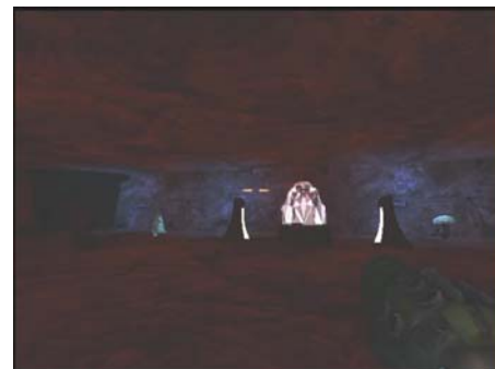
Figure 6. Warm/Cool Color Contrast

During game play, the author increased or decreased tension based on danger. A danger value was defined as a function of health and number of enemies within the environment. The author used a combination of patterns I and III, where increase in tension was projected as an increase in warmth and saturation of surrounding lights. Thus, if the user is confronted with many monsters and his health is dropping over time, the warmth and saturation of color will increase over time showing an increase in tension. While if the player is killing monsters and danger level is