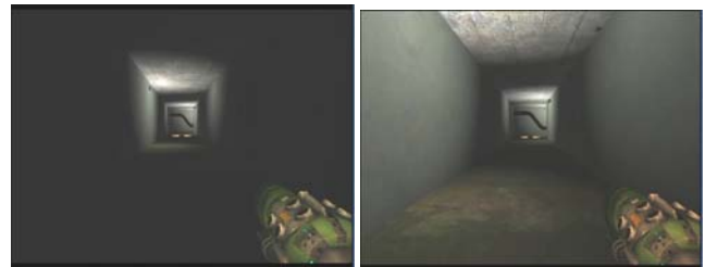
Figure 5. Varying Brightness Contrast

Using this implementation within Unreal, a first person shooter mod was developed. The lighting compositions varied within the level composed. For example, in the beginning a decrease of brightness contrast was established through the opening scene, shown in figure 5. At the end, a warm/cool color contrast as well as brightness contrast was used, as shown in figure 6.