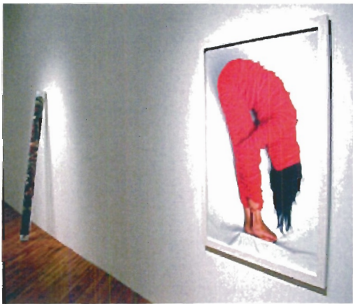
Plate 8: White Thread Installation © Rebecca Belmore, 2003, by permission

non-aboriginal people or white people. So whites, Indians, and that whole relationship I think is there. Then I think if you just look over (a building near by where we were sitting outside) there you see the flag, the red and white - so its all that kind of thinking of nation and politics and the body, and the aboriginal body within this whiteness within the frame, within the frame of the white world and that kind of struggle to manage our lives and to I think I guess on another level its red as blood, red as being representing the red people. 43