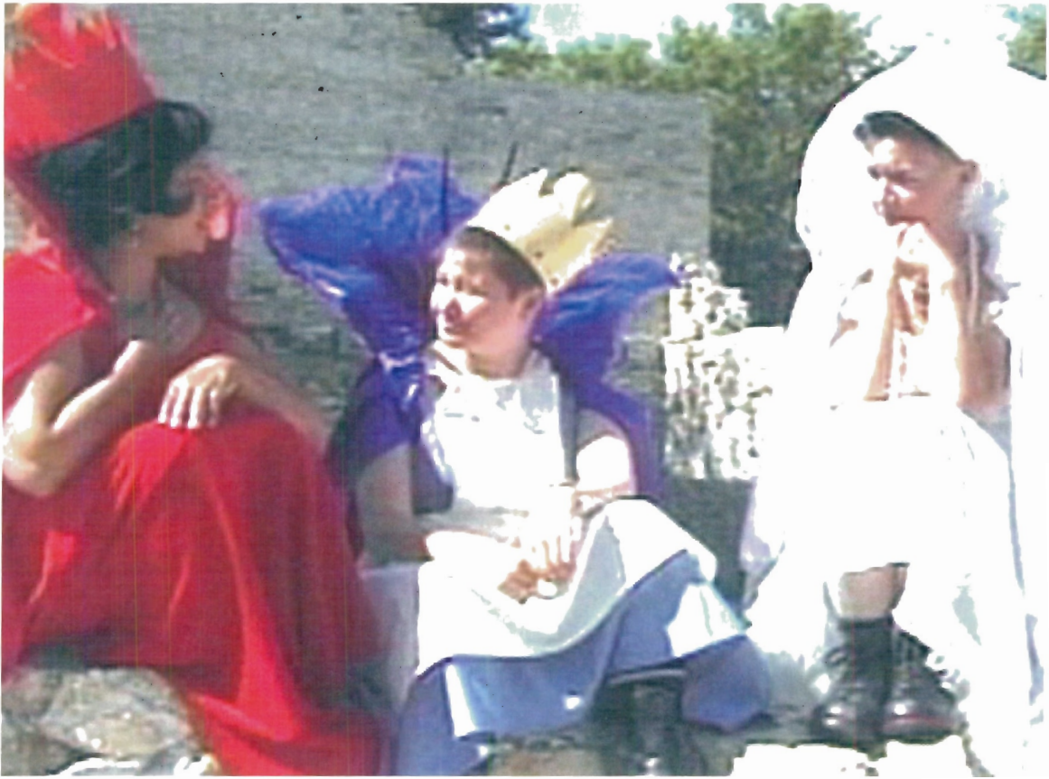
Plate 2: Through the Looking Glass © Thiza Cuthand. 2003, by permission Video still courtesy of Video Pool

Alice is now wearing a beige coloured crown. They converse about Alice's potential to be a Queen if she would just decide whether she is Red or White. The White Queen laments, " I would feel better about her being Queen if she would be clear on the colour issue. " The Red Queen completely agrees. Getting exasperated, Alice states, " well what color should I be? ". The White Queen sternly announces, " White ", as the Red Queen follows sternly with, " You should be Red ". As the two Queens carry on arguing whether Alice is Red or White, Alice's head moves back and