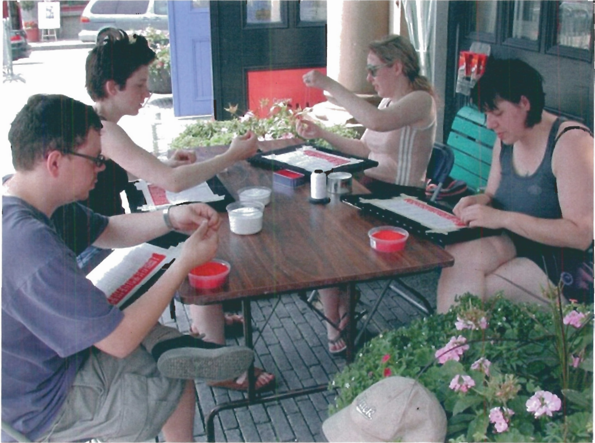
Plate 6: Indian Act Beads on Canvas 2003

This participatory event expanded the artist's approach to her own practice, leading her into a more intense place of listening. She described the process as a huge shift. Her earlier works had dealt heavily with conceptual ideas in a highly controlled and planned-out way. In this instance, she worked from an intuitive place and unlearned how she had been taught to work conceptually. This act of commitment of everyone coming together to make this work enabled the artist to let go of her prior ideas of control and perfection and to make room for the translation of space and place involved in the beaders workshops across the country.