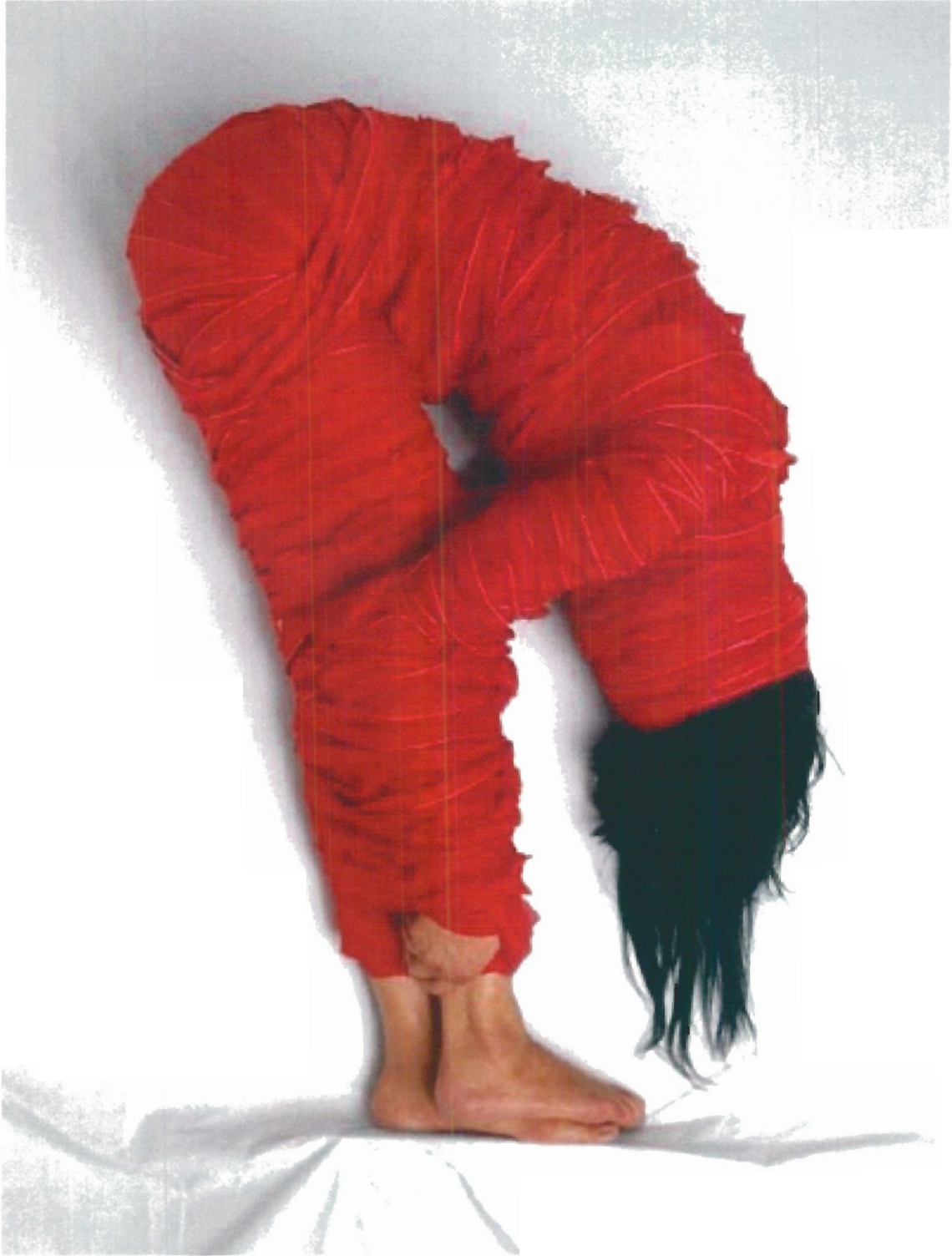
Plate 7: White Thread © Rebecca Belmore, 2003