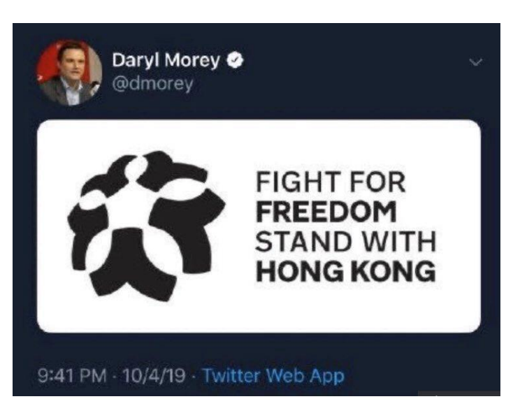
Figure 1 Tweet published by Daryl Morey which supports the plight of the pro-democracy Hong Kong protest movement.

This essay examines an ongoing case study, where on October 4, 2019 general manager (GM) Daryl Morey of the National Basketball Association's Houston Rockets franchise published a tweet which professed sympathy and support for the pro-Democracy protest movement occurring in Hong Kong (Cha & Lim, 2019, p. 23); an action which set off a chain of events that has culminated in the disruption of the NBA's foothold in Chinese economic markets (p. 25). The tweet (Figure 1) shared a graphic made by Hong Kong activist group Stand With Hong Kong, which read "Fight for Freedom, Stand with Hong Kong", and its sharing by Morey subsequently provoked visceral debates and commentary publicly occurring through the media from actors both external and internal to the NBA (Perper, 2019; Cha & Lim, 2019, pp. 33). In the following days, it was announced by both private and state-run Chinese broadcasters that all National Basketball Association (NBA) games would be removed from Chinese media platforms (Cha & Lim, 2019, p. 30; Perper, 2019). My analysis of this case pertains to scrutinizing the retaliation from Chinese state and business entities, and the debates which occurred internal and external to the NBA in response to Morey's post; who was accused of "challenging [China's] national sovereignty and social stability" for sharing a graphic sympathetic to the pro-democracy Hong Kong protest movement (Perper, 2019).