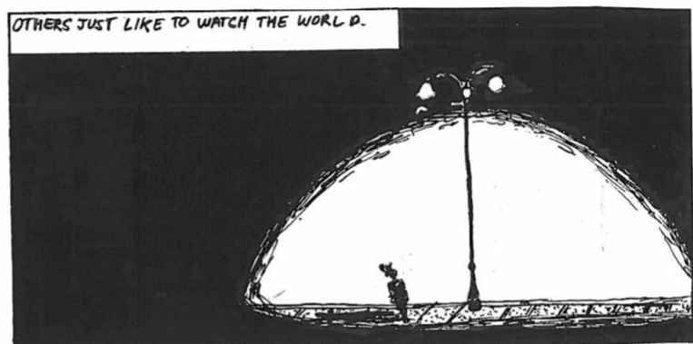
Figure 1: Story of an Artist

Excerpt from comic strip by Rylan Schinkel, Story of an artist (Don't be scared!) , 2012. Reproduced with permission.