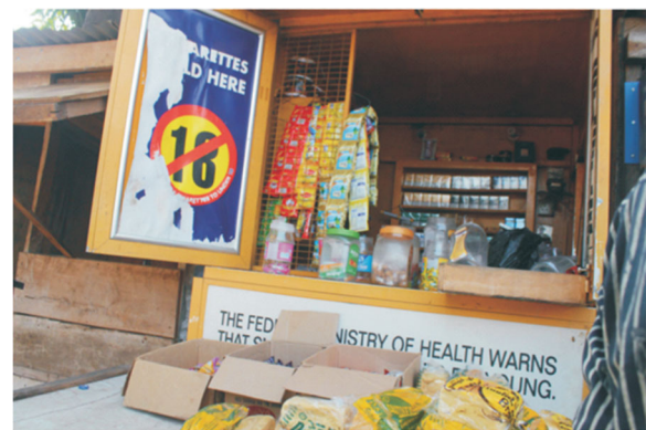
Fig. 4 BAT branded shop opposite an International school with the warning sign mutilated and the health warning hidden from view.