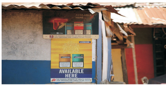
Fig. 5 Cigarette advertisement conspicuously pasted on wall.

“Discover Gold’. Gold is something everybody wants to own - that is their marketing strategy.” (Rothmans young smoker, Lagos - Nigeria). (Market Behaviour Limited, 1992 [29])