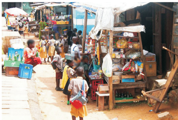
Fig. 3 Students buying sweets and biscuits at a kiosk where cigarettes are sold.

The industry clearly noted outlets patronised by young smokers (“YAUS”) and targeted them with brands with a youthful appeal. Figure 3 below shows