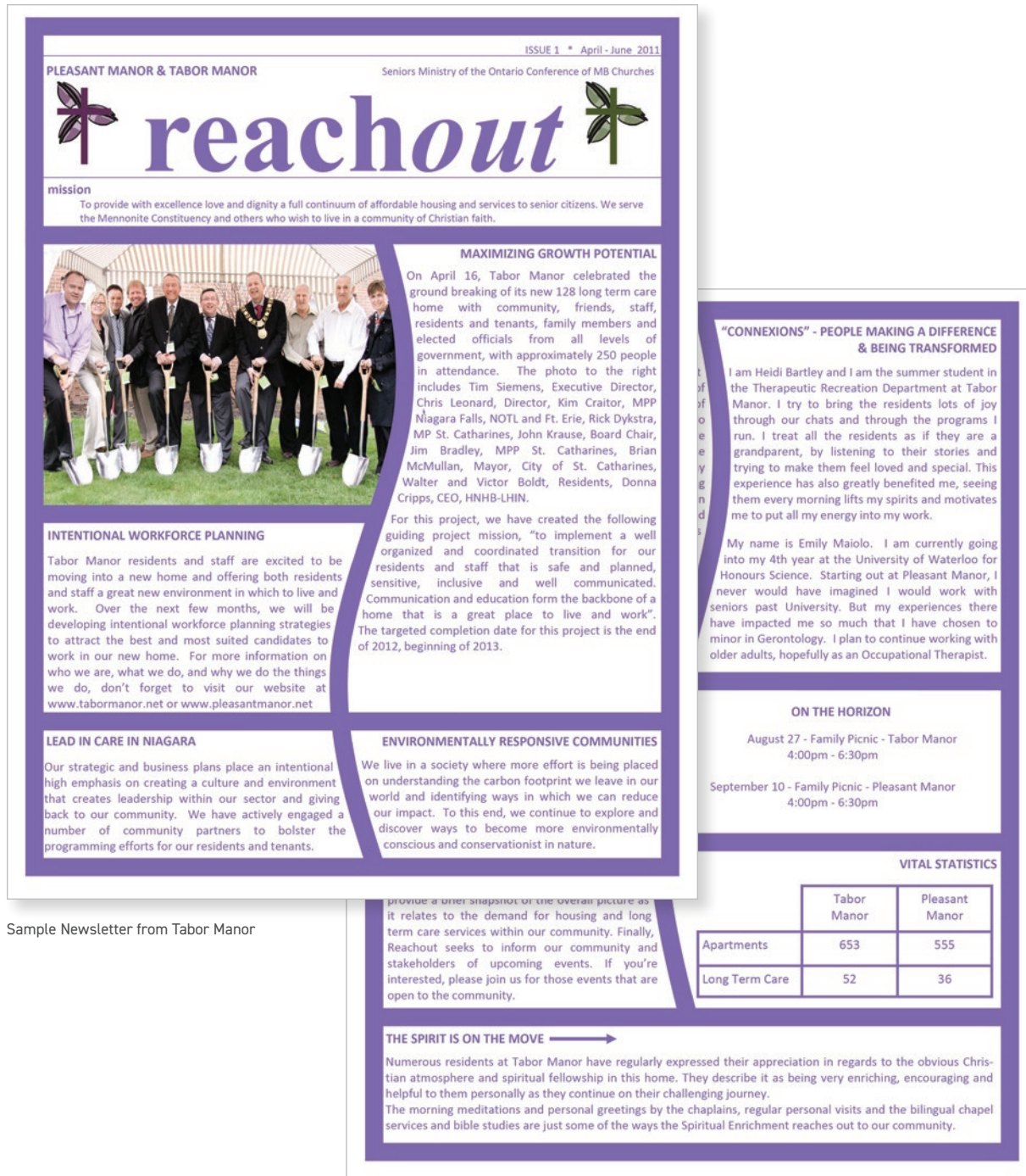
Sample Newsletter from Tabor Manor