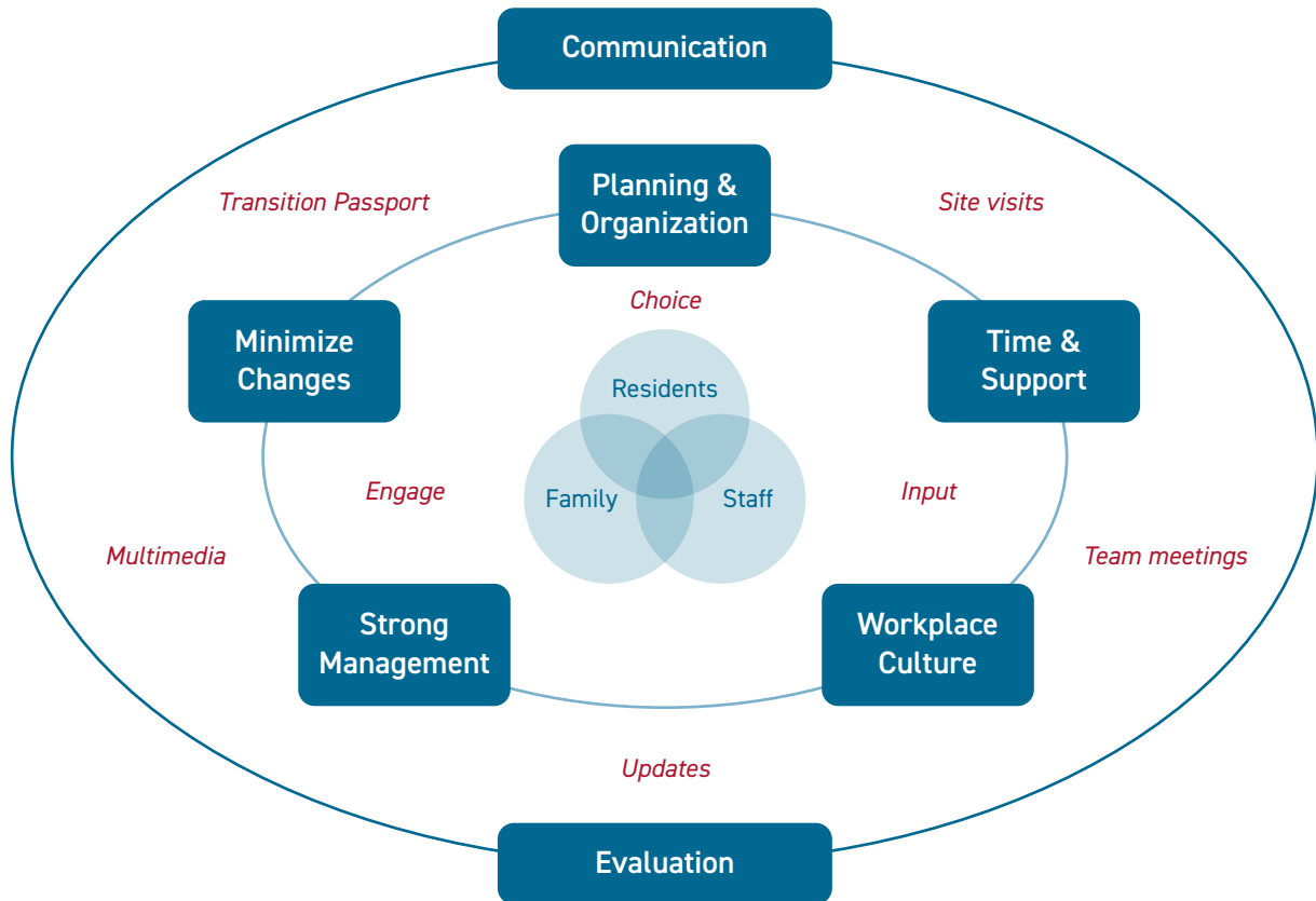
Figure 2: Preliminary Schematic of En Masse Interinstitutional Relocation Themes