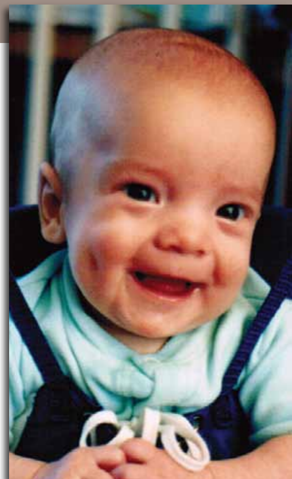
Three of the interventions — Brief Intervention , Brief Intervention with Partners and Motivational Interview — led to positive outcomes regarding alcohol use.

All interventions were very brief, consisting of a single 10- to 60-minute session. 18, 19 While all interventions took place in the prenatal care clinics where women were recruited, the main component of one involved a self-help manual that participants completed independently at home. 19 Two interventions — Brief Intervention and Brief Intervention with Partners — were primarily delivered to older, socio-economically advantaged women. In contrast, the other two interventions — Brief Education and Self-Help Manual and Motivational Interview — were primarily delivered to younger, socio-economically disadvantaged women. The participants and the interventions are further described in Table 4.