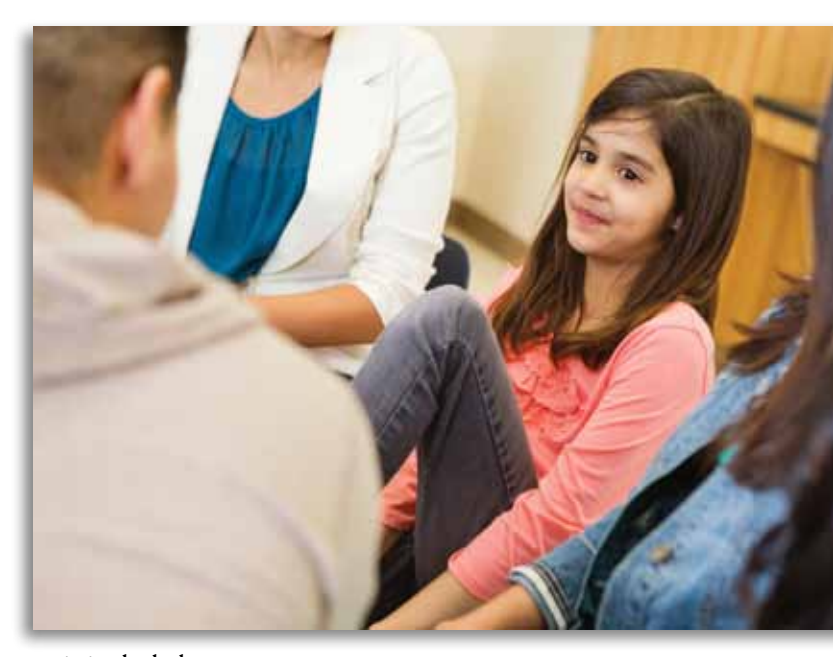
Practitioners taught children techniques to address physical and cognitive OCD symptoms.

While treatment techniques varied slightly, all four CBT studies nevertheless followed core CBT principles. First, all the studies began with practitioners presenting children and parents with educational information about OCD and explaining what was involved in treatment. <sup>14, 17–19</sup> As a part of this process, children were encouraged to give the disorder a "nasty nickname" — to help them "boss back" their symptoms and to help ensure they did not feel blamed for their