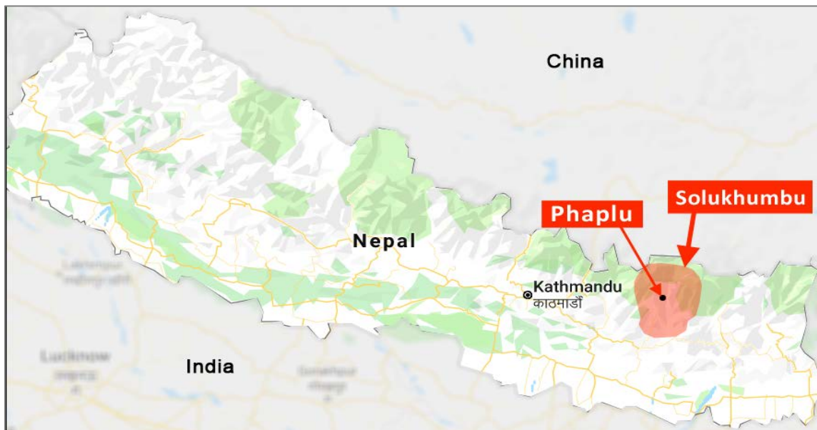
Figure 4.1 Map of Nepal with Solukhumbu District in Red

based births; 2) it was little studied, so new findings would address gaps in knowledge; and 3) I had strong connections there. The northern part called 'Khumbu', is famous for Mount Everest and Sagarmatha National Park, and its Sherpa people have a reputation as expert climbers and are valued as porters for high altitude expeditions. The Lower Solukhumbu, called 'Solu', is the southern part of Solukhumbu district. The southern part is less well known, has more inhabitants than Khumbu and is populated by diverse ethnic communities, although total population from a 2011 census was around 100,000 (Code for Nepal, n.d.) My research took place in the lower mountains of Solu. The administrative centre of Solu district, the town of Salleri (population 6590 in 2011) (Code for Nepal, n.d.) is contiguous with the town of Paphlu, where the hospital and airport are located. The area is primarily agricultural and tourism plays a very small part of its economy compared to the Khumbu district, where high altitude treks and expedition tourism predominate as sources of income for local people.