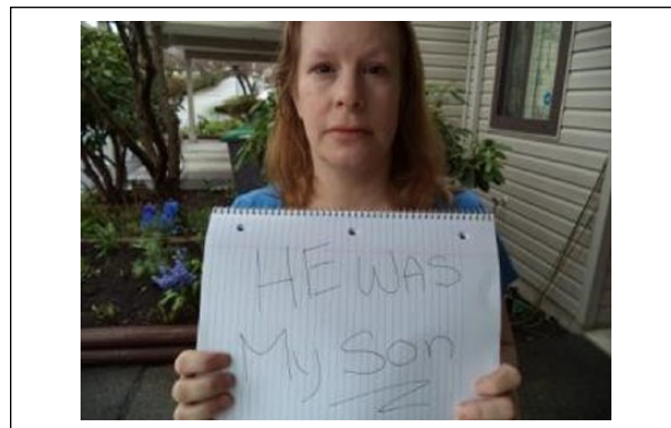
Figure 2. He was my son.