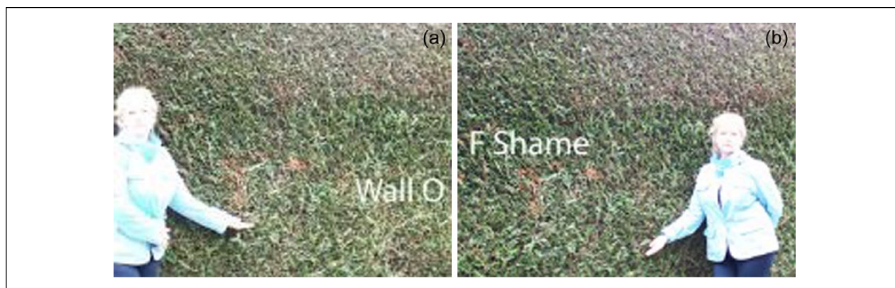
Figure 5. Wall of Shame.