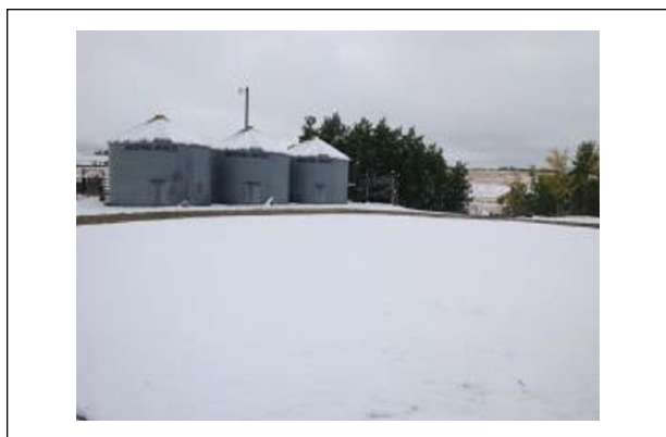
Figure 6. Bleak Winters.