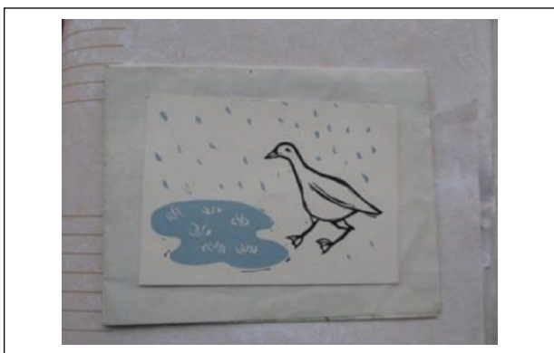
Figure 4. Rainy Days.

to protect their man from suicide. The shadow data wherein mothers were understood by participants to be especially vulnerable to the futile torment flowing from a mother's lack of knowing confirmed the heavy weight invoked by dominant discourses of femininity on many participants—and the women around them.