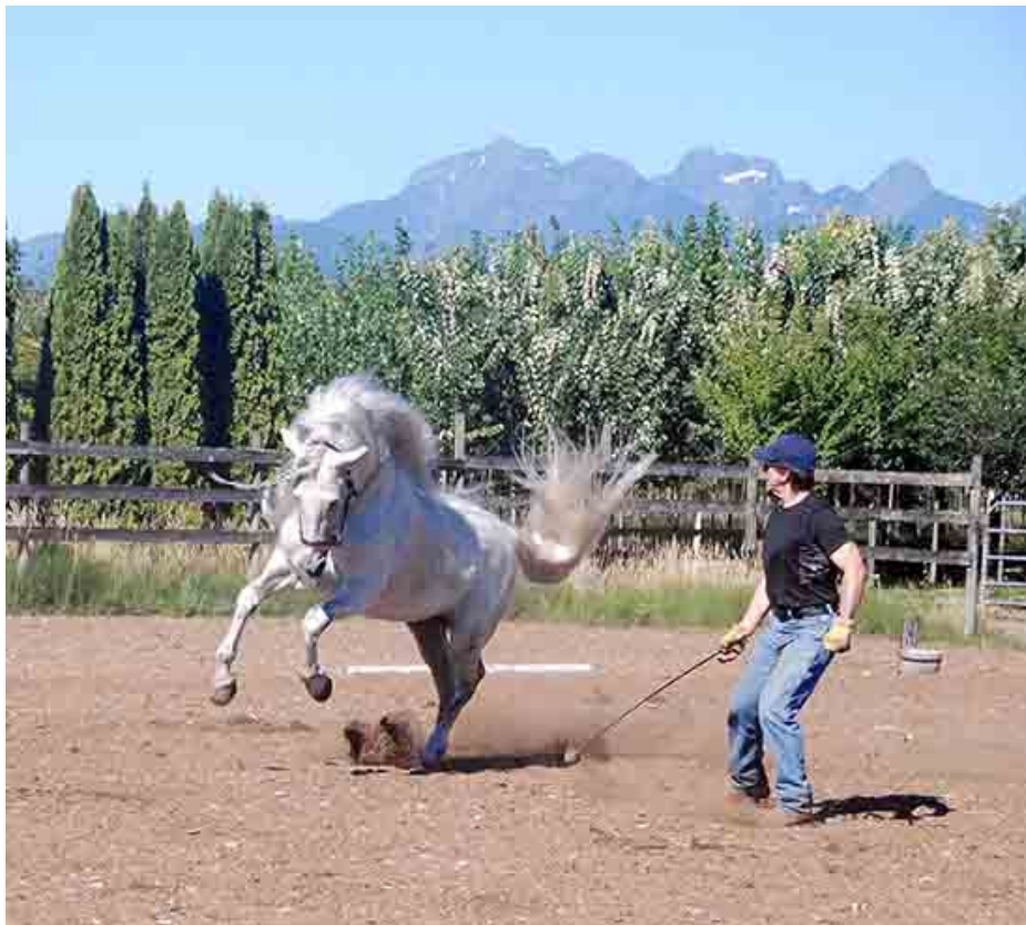
Lucente Releasing Pent-Up Energy

Lucente has shown in this passage of unfettered movement the building of his life force to a level we humans might call ecstatic. But he is not in any way out of his body; in fact, Lucente gives the appearance of being in full command of his balance, the cadence and rate of his motions, and their direction and amplitude. There appears to be an exemplary I can of movement agency to what I am observing.