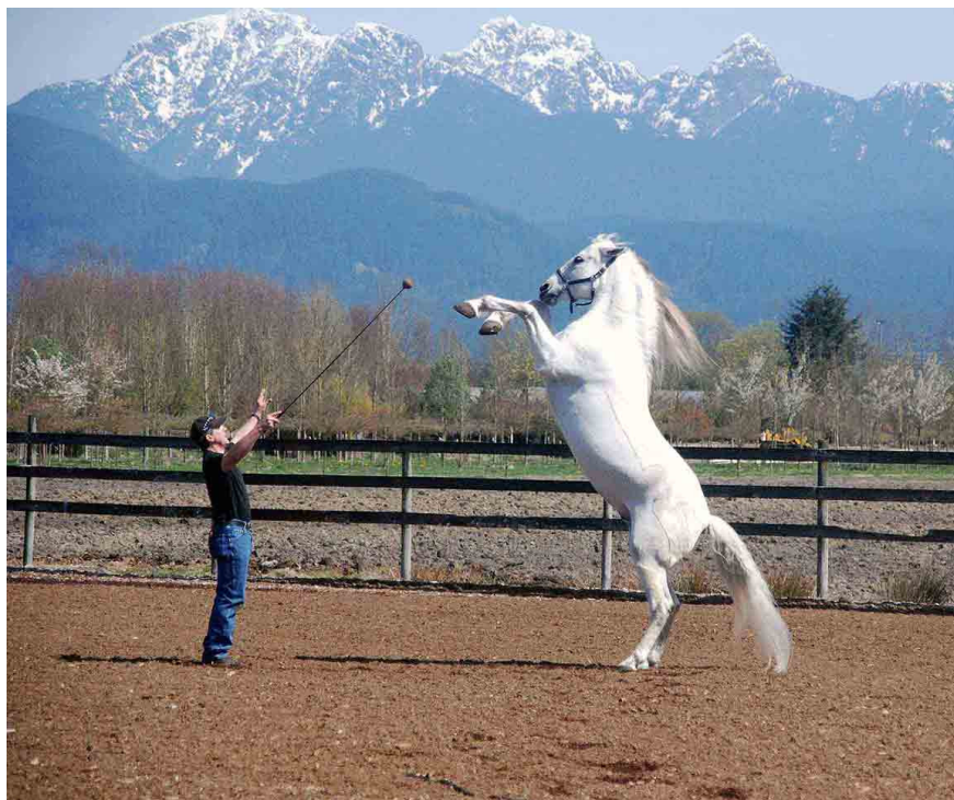
Sparky Rearing Up

contrary, we come to life and bring up the life in others as they do in us through movements that are the ecstatic expressions of immanent affective impressions. Henry (2000/2015) writes that: “‘I can’ does not signify that now I am in a position to make this [or that] movement. The reality of a movement is not exhausted in its singular phenomenological effectuation: It resides in the power to accomplish it” (p. 143). Such power of accomplishment, of motivational effect, is first an impulsion, a force, a drive, and a desire that is felt in its motional affectivity.