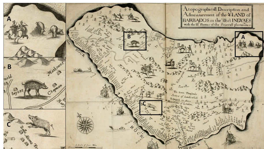
Fig 1. Map of Barbados published in A True & Exact History of the Island of Barbados (1657) by Richard Ligon. (A) smooth form “pig”; (B and C) hairy form “pig”. Barbados geographic coordinates: 13° 10′ 0″ N, 59° 32′ 0″ W. Map credit: public domain, https://www.biodiversitylibrary.org/item/113913#page/22/mode/1up CC BY-NC-SA 4.0 License; image cropped from original and adjusted for temperature and sharpness.

Ligon's account of pig introduction has become conventional wisdom among scholars and is a fixture of Barbados' colonial origin story [1, 3, 11, 12]. The pig constitutes a minor preoccupation for Ligon. He discusses the animal on ten occasions in A True & Exact History , with reference to the circumstances of their translocation, ostensible hunting by visiting Amerindians, husbandry, size, taste, and culinary preparation. Elements of this narrative, however,