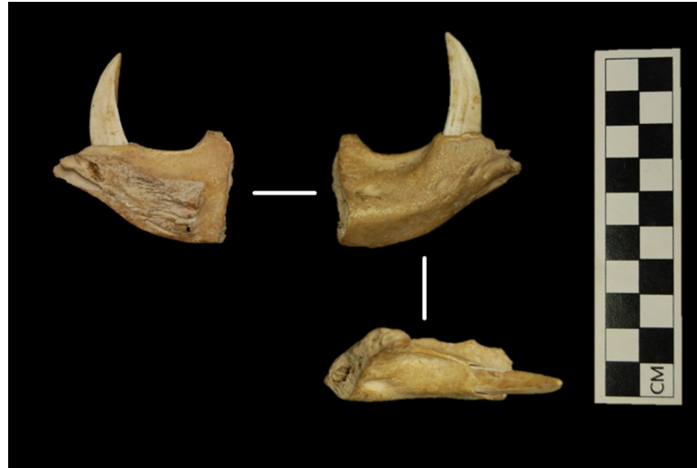
Fig 3. Right partial mandible of a peccary (Tayassuidae) collected from the Chancery Lane site, Barbados. From the collections of the Barbados Museum and Historical Society. Note the diastema lacking a premolar and the upward projecting canine, diagnostic attributes for peccary (Tayassuidae) that distinguish it from pig ( Sus scrofa ).

https://doi.org/10.1371/journal.pone.0216458.g003