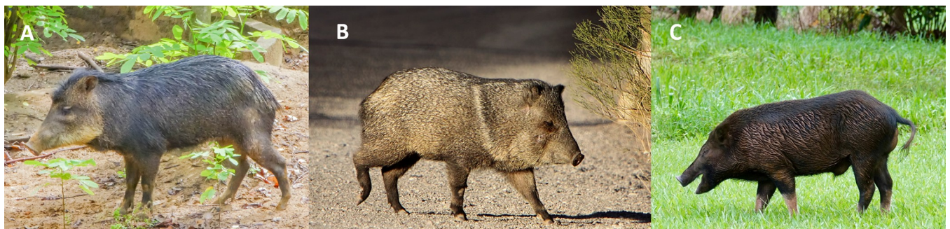
Fig 2. Physical similarities between peccaries and feral pig. (A) white-lipped peccary ( Tayassu pecari); (B) collared peccary ( Pecari tajacu); (C) feral pig ( Sus scrofa).