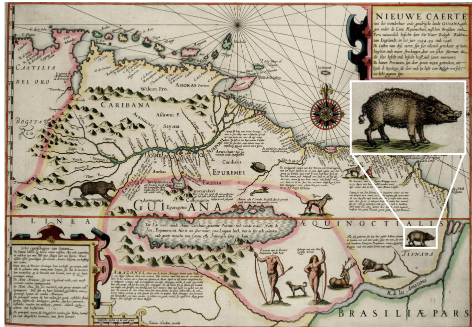
Fig 6. Map of the Guianas, Nieuwe caerte van het Wonderbaer ende Goudrijcke Landt Guiana . Drafted by Jodocus Hondius ca. 1598. Inset: native peccary. Map credit: public domain, https://commons.wikimedia.org/wiki/File:1599_Guyana_Hondius.jpg , image cropped from original with inset added.

https://doi.org/10.1371/journal.pone.0216458.g006