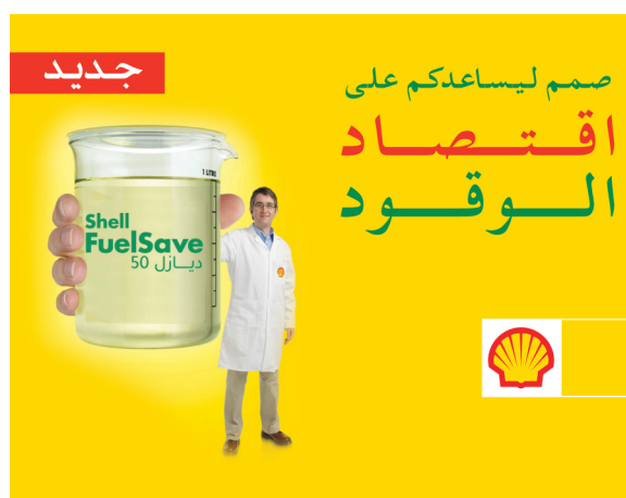
Figure 5 3 : Phrasal substitution (host L → English) of product name in a poster ad

When the company's website promoting this real estate property was still accessible in 2014, it provided a virtual tour through the apartment units. The apartments were technologically advanced, with a striking open-concept, Western style of architecture that is markedly different from the type of accommodations with which most Moroccans are acquainted. For example, the housing units had parquet flooring instead of the traditional tiles or mosaic flooring found in Moroccan architecture, and plain ceilings rather than engraved plaster ones. The kitchens were open to the living-rooms, as opposed to being closed-concept with separate rooms that maintain traditional privacy for women, especially when male guests are present. In line with Bhatia's (1992: 213) findings, the English name of the residential building connotes a sense that the apartments are of high quality. In the Moroccan context, Urban Square II communicates an understanding of a modern, progressive design that is new and sophisticated, yet comfortable.