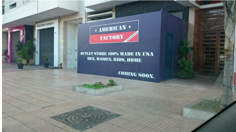
Figure 10. English monolingual wallscape ad for a clothing store

In figure 10, the English monolingual text of the wallscape advertisement announces the future opening of a store called American Factory . We are unfamiliar with any internationally operating company of that name, and an Internet search of the term failed to produce any results for a company website with the depicted logo. We therefore assume this to be a local or regional business, perhaps the first such store to open under this brand name. Should that be the case, this advertisement has a distinct significance, as it would be an example of a local entrepreneur advertising exclusively in English. In other words, a local Moroccan business is using English instead of one of the country's historically primary languages to communicate with Moroccan consumers. This is in contrast to the previous examples of US- and overseas-based global corporations using monolingual English ads to target potential customers.