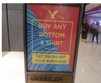
Figure 9: English monolingual advertisement for clothing appearing in storefront signage in a shopping mall

This message is reinforced by the use of English for the slogan pure pleasure is inside , variants of which were used by the brand internationally (Comunicaffe International, 2013). Appearing in bigger font to attract the attention of Moroccan coffee lovers, the noun phrase pure pleasure is an example of English words with French cognates ( pur plaisir ). Despite its Swiss origin (Nestlé Nespresso, 2018), the company employs English to adopt an international identity, with this language choice conveying a notion of quality, taste, and originality. In using English, the ad communicates that consumers of Nespresso will feel sophisticated, chic, and elegant (see also Martin, 1998: 166).