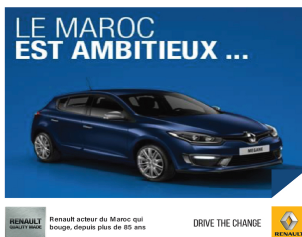
Figure 6: Sentential substitution (host L → English) of a slogan of a car company in a poster ad

passage in the upper right-hand corner states ‘ designed to save you fuel ’. The Shell Oil Company product name FuelSave Diesel 50 again falls under the phrasal substitution category (host L → English). The product is an additive-enriched fuel that drivers can purchase to help improve their cars’ mileage. While FuelSave Diesel 50 is the product’s complete name, only half of it, FuelSave , appears in English; Diesel 50 is written in Arabic. It is difficult to estimate how intelligible the product name is to a potential customer, but the ad’s visuals do enhance the message of the product name. The accompanying picture of a male laboratory scientist holding a glass beaker conveys the sense that the product is e.g. scientifically tested, effective, clean, and engine-friendly.