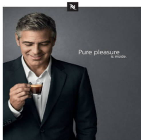
Figure 8: English monolingual wallscape advertisement for coffee appearing on the side of a building

Using English here moreover functions as a reminder of the product's country of origin, which has significance for the Moroccan consumer. Some Moroccans may not necessarily be familiar yet with the Skechers brand; however, using English gives the product a Western identity. That identity becomes more specific with the portrayal of Meb Keflezighi, an African immigrant to the United States who has become a star athlete for that country. The use of English with Keflezighi as a spokesperson therefore establishes a connection between Africa, where the target audience is located, and the product's American origins (Skechers USA, Inc., 2018). In addition, English functions as a token of the product's reliability (Martin, 2007: 175), suggesting high standards of quality, durability, and comfort to the Moroccan audience.