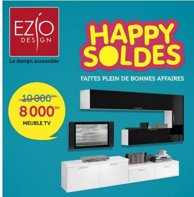
Figure 2: Isolated lexical substitution (host L → English) in a home furniture poster ad located at the side of a road in a business district

The advertisement in figure 2, with the distinctive phrase Happy Soldes ( Happy Sales ), is an example of an isolated lexical substitution (host L → English). Appearing at the top of the ad in a big font and bright colors, this phrase serves as an attention-getter. Bhatia (1987: 35) notes that the text of an attention-getter is usually short and rarely constitutes a full sentence. In the case of an isolated lexical substitution, ‘a single English word is inserted for socio-psychological effects’ (Martin, 2002: 394). Within the context of Morocco, this advertisement for furniture, prominently containing the English lexical item happy , conveys a sense of modernization, utility, quality, and innovation.