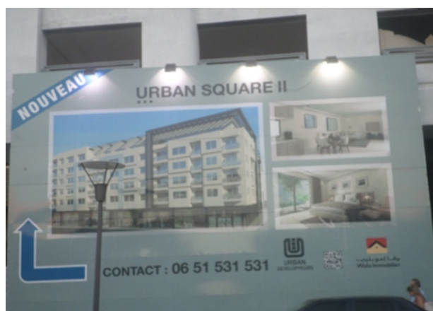
Figure 4: Phrasal substitution (host L → English) in a residential building wallscape ad

In Morocco, high-end real estate development companies such as the advertiser in figure 3, Prestigia Luxury Homes, frequently use French in their ads in order to stand out in the market. Using English here creates an added socio-psychological effect, suggesting an even higher degree of quality, sophistication, luxury, and exclusivity. In the Moroccan context, the English phrase summer days conveys a heightened sense of a relaxing and inviting lifestyle in a scenic, warm location. This additional English use has a stronger impact on the consumer than a monolingual French ad would have.