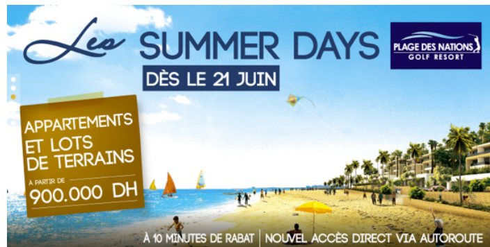
Figure 3: Phrasal substitution 2 (host L→ English) in a real estate development poster ad

The next poster advertisement, in figure 3, uses a phrasal substitution to promote apartments and parcels of land for sale on Morocco's northwest coast.