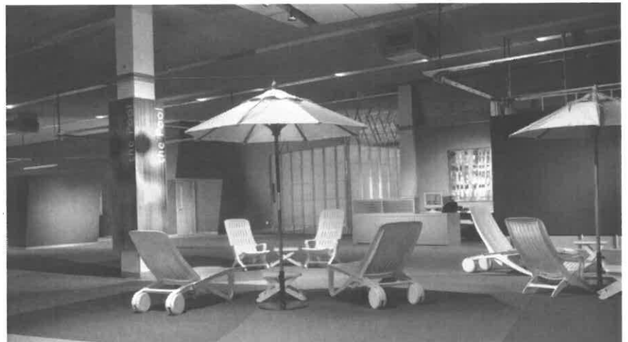
"The Pool" open gathering place.

TechBC's classes took place in mall storefronts, including a former Zellers location. This story of TechBC is told through the voices of its former students and other members of its community. 1