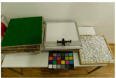
Figure 3 Example of a clearly single-illuminant scene.