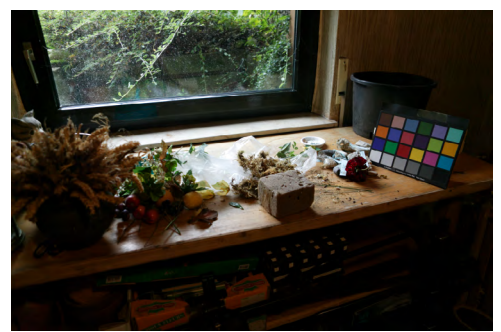
Figure 1 Example of a multiple-illuminant scene with light coming both from the room and window.

We manually sorted the original 568 images into two groups according to whether the images were of single-illuminant or multiple-illuminant scenes. Sorting in this way is difficult because it can be hard to discern the nature of the scene illumination from the image. Figure 1 shows a typical case where the presence of multiple sources of illumination is very clear. Similarly, the traffic light in Figure 2 is an obvious additional illuminant. Figure 3 shows a situation in which it seems pretty clear that there is only a single illuminant. Figure 4 shows a somewhat ambiguous case, since there are areas in direct sun and others in shadow. The Colorchecker itself appears to be partly in sun and partly in shadow. There are also the clouds in the distance. However, this appears to be a typical outdoor scene basically dominated by sunlight/skylight and so we classified it as a single-illuminant scene. If we were to be any more strict in our interpretation of what constitutes a single-illuminant scene then almost the entire dataset would be classified as multiple-illuminant. Based on this type of analysis of each image, the 568 dataset is divided into 310 single-illuminant and 258 multiple-illuminant scenes. We denote the two images subsets as S (single) and M (multiple), and the full set of 568 images as F. The complete lists of image numbers for sets S and M are listed in the Appendix.