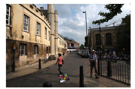
Figure 4 Example of a somewhat ambiguous scene with sunlight and shadow but classified as single-illuminant nonetheless.