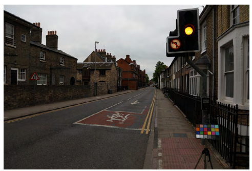
Figure 2 Example of a multiple-illuminant scene containing a visible light source.