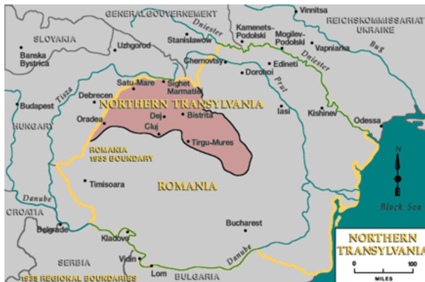
Figure 1. A Map of Romania, Northern Transylvania and Hungary 1940-1944 58

The story of Rudolf Kastner played out in a myriad of locations from Kolozvar/Cluj Napoca, Budapest, Bucharest, Bergen-Belsen, Istanbul, Switzerland, and finally Jerusalem in Israel. An important aspect of this thesis is the ghettoization of Jews in Cluj which began in May of 1944, which in fact was part of an long-standing effort by Eichmann and his offices in Budapest to begin the final and most gruesome extermination of Jews in Eastern Europe - also one of the final communities to be untouched in Hungary and Northern Transylvania which included mostly Hungarian but also many Romanian and German Jews as well. 57