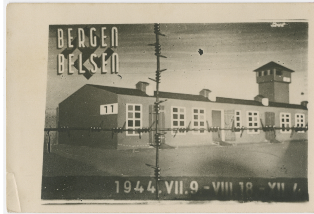
Figure 3. Bergen-Belsen Postcard 537

Along with this postcard one can also find handkerchiefs, children's dolls and suitcases all of which were left by some such Bela Gondos, who survived the war due to Kastner's actions. The halls filled with belongings in Auschwitz are innumerable larger as they hold the personal objects of those who perished. The micro-narratives, and traumas were very different across the entire Shoah, albeit the common themes of loss and despair seemed to loom everywhere nonetheless.