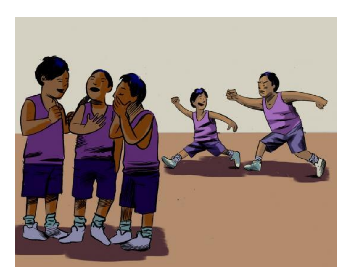
"In that case, we can have ten different teams on the court... And she likes you too!" says Small Number as he runs away from a very angry Big Circle while their friends start laughing.