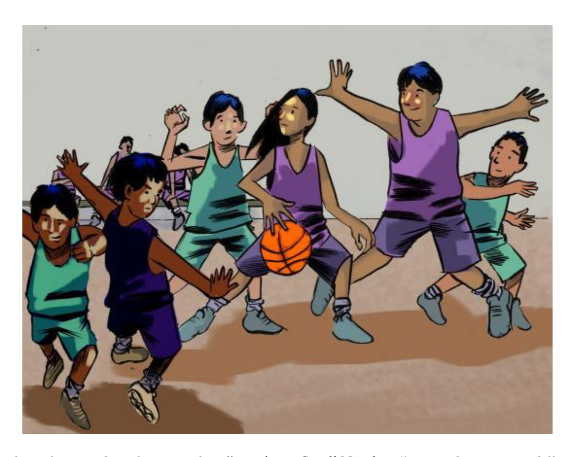
"With Perfect Number playing with us," continues Small Number, "we can have twenty different teams on the court and nobody is ever going to get tired!"