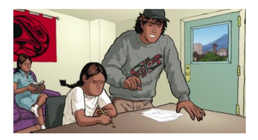
Full Angle looks at Small Number's homework problem and smiles. "I love geometry problems!" Small Number frowns: "What good is geometry for?"