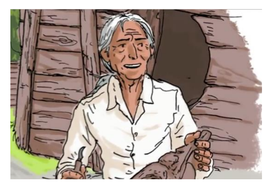
Grandpa smiles. "I know that canoe. It was once the fastest canoe in our village. It was built by my father and two of his brothers." Grandpa proudly continues, "All the sons of my grandfather were known as great wood carvers."

Small Number races home, where Grandpa is carving the surface of a huge wooden dish. Small Number is shouting excitedly and Grandpa looks up. He sees the bruise on Small Number's forehead. " What happened?! " Grandpa asks. Small Number has forgotten that he bumped his head and starts to tell Grandpa about finding the canoe: " I found an old canoe down on the beach! It must be at least a hundred years old! "