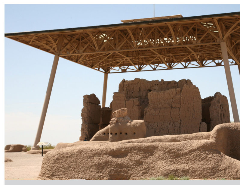
Casa Grande Ruins National Monument, Arizona, USA.

Again, the answer is yes and no. All peoples possess the inalienable right to manage their heritage, but Indigenous peoples were denied that right for a long time (and many still are). The term "Indigenous" has come to stand for peoples who have historical continuity with land and who have been affected by foreign political, legal, cultural, and economic impositions. As a result, the heritage of many Indigenous peoples has been destroyed or taken over by newcomers. For example, in 2013 developers in Belize demolished the 2000-year- old Nohmul temple without consulting contemporary Maya descendants. In the United States, the National Park Service allows rock climbing to continue on the natural formation, referred to in English as "Devil's Tower," despite the fact that recreational use is seen as sacrilegious by Native Americans who conduct ceremonies there. Because of the past and ongoing harms to Indigenous heritage, it is imperative that those engaging with Indigenous people and their heritage today do so with the utmost care and respect.