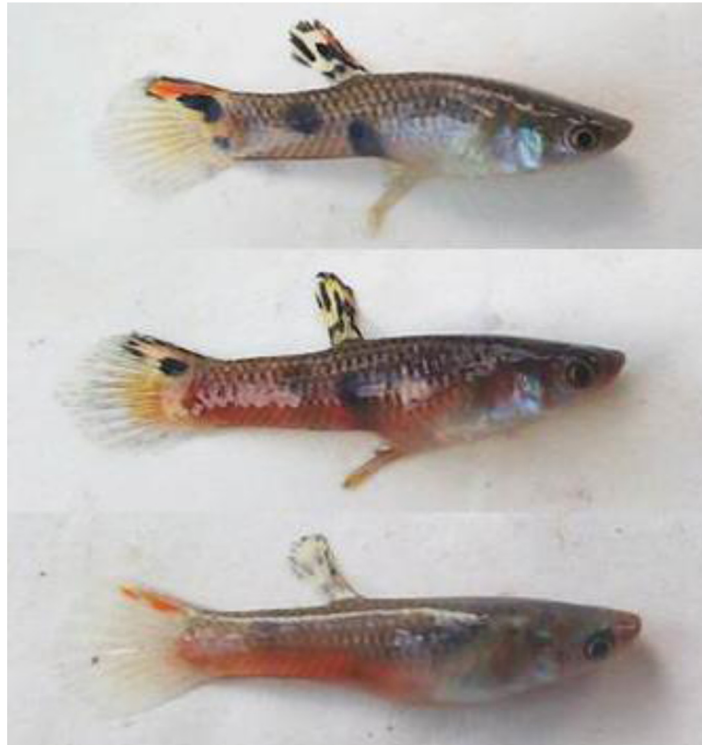
Fig 1. Standard (top), fully red (mid) and partially red (bottom) morph of P. picta from Georgetown, Guyana.