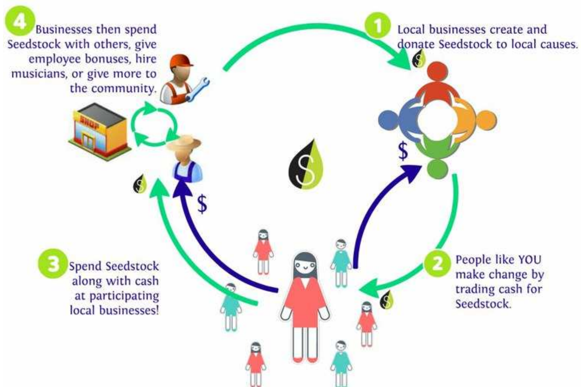
Figure A1 Seedstock circulation using the Community Way structure