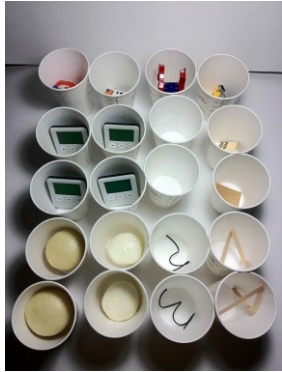
Figure 1: Objects used in experiment

this need to correlate disparate domains is paramount to properly understanding the use of thermal sensations in such an application.