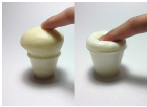
Figure 4: Example of polyurethane foam objects used (Soft and hard metaphor)

interpretation of the metaphors would emerge.