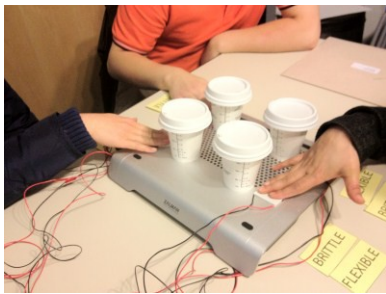
Figure 2: Setup of experiment

These metaphors were selected by virtue of their potential to have pre-conceptual mental models defined in terms of temperature, and for having both related and distinct properties that fall into two main categories: energy states (i.e. motion, luminosity) and physical properties (i.e. texture, pliability). We believed that these six metaphors would provide a suitable opportunity to study what possible correlations could be made for each individual metaphor, between metaphors, between the two categories above, and possibly beyond. The goal was to clarify any observed patterns, be it through correlations, or through group interpretation tendencies, and use the patterns to further establish recommendations for identifying potential population stereotypes for thermal sensations.