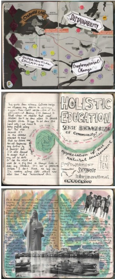
Figure 2. Collages in a visual journal: Another example of a reflective and creative portfolio.

exploration of what we can learn about design activism in the classroom for HCI education and moreover, inform our first reflections on the role of design activism in HCI.