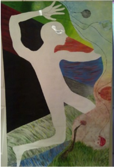
Figure 1. Body Mapping painting: a portfolio representing the growth of a student throughout the semester.

journey to realize a state of being, as well as a desire to contribute to a greater societal good” [8, p.20]. This implies that design activism demands designers to learn, reflect and take on a certain position.