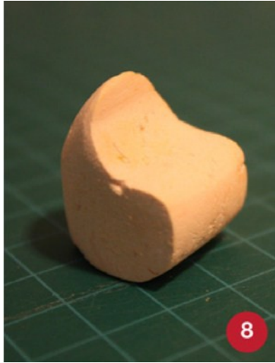
Figure 5. A yam potato used as prototyping material.