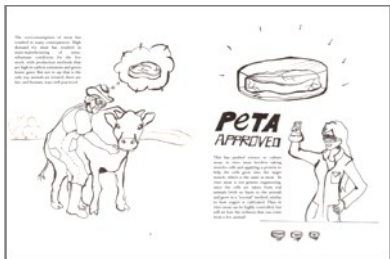
Figure 6. Storyboard showing food dilemmas.

the goal of bringing awareness to sustainability issues. In this case, designers can become advocates for particular ways of living, using design as a medium to convey information. One project in the class was the creation of a storyboard to discuss food dilemmas aiming to create a document that was thought provoking (see figure 6). The student expressed: "I can't tell people what to do and there are no black and white or easy answers [...] what I want to instill in my project is have people question things and instill in others that sense of curiosity and self-motivation." In this case, the project relied deeply on the theme of advocacy and activism that was discussed in the earlier weeks of the course.