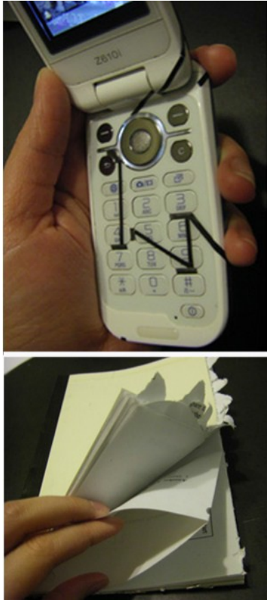
Figure 4. Trace lines connecting repairs and broken parts (top) and a tear book (bottom) showing speculative reframing.

course, more specifically their design decisions in the construction of their project.