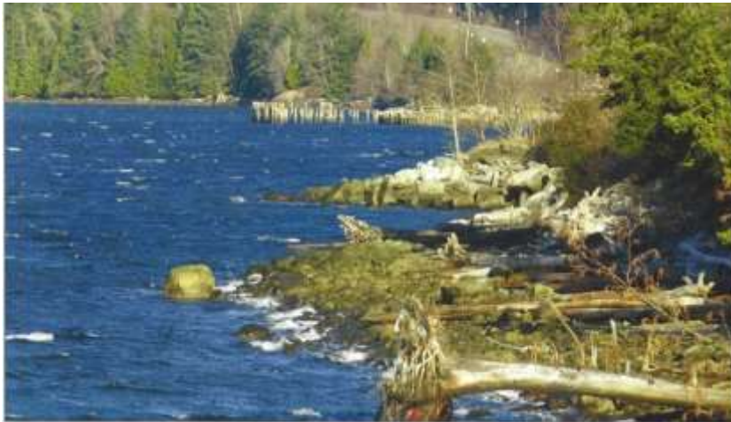
Figure 3 Image of Minaty Bay and Southwest Corner of Britannia (November 2014)

The Master Plan area includes the low level lands owned by Taicheng Development Corporation (Taicheng) noted as Blocks A, B and part of Block C (noted in the hatched lined area), as well as, the Howe Sound waterfront properties owned by the Crown, both in front of the Taicheng lands (Lot 5210) and the Britannia Mine Museum (Lot 5208). The Crown has officially