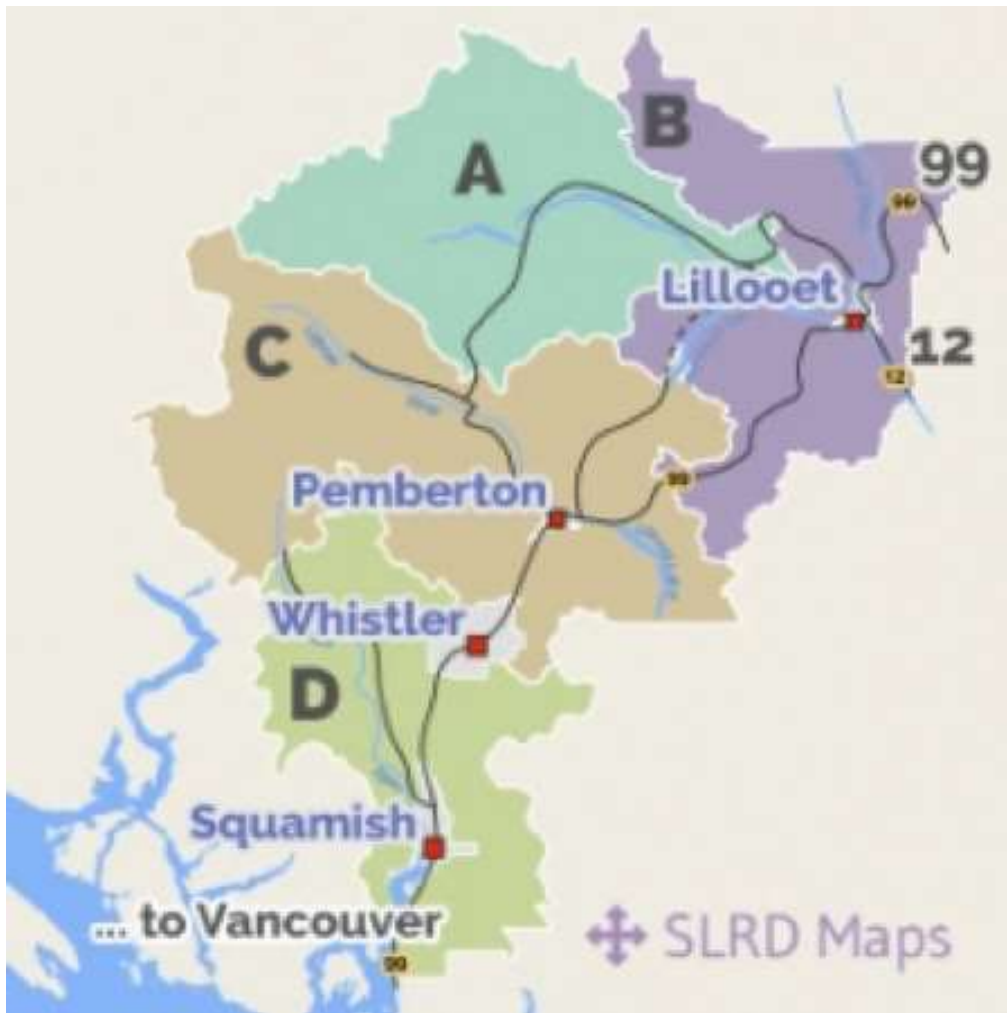
Figure 7 SLRD Map

Regional districts have many roles when it comes to providing local government services. Understanding these roles is key to effective relationships. Britannia Beach is a rural unincorporated community within Electoral D of the Squamish-Lillooet Regional District (SLRD).