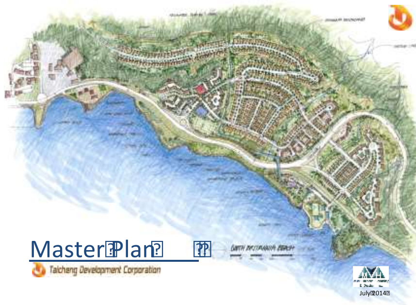
Figure 1 South Britannia Master Plan (November 2014)

Taicheng have been involved in developing high-density communities and hotels outside Mainland China for 15 years. Peter Cheng, the owner has become a billionaire from having nothing as a young boy to purchasing the South Britannia lands along the Sea to Sky highway. Taicheng paid $30.5 million cash for 5000 acres in South Britannia, rescuing it from a court-ordered hold from the previous owners. (Morton, 2012) The lands include the gravel pit directly south of Britannia mine, the former Makin Lands and land that stretches up to the top of Furry Creek and down to the waterfront. Taicheng plans on eventually constructing a sustainable community of up to 4,000 homes, which will be multi income- level, including single homes, duplexes, townhouses and small apartment dwellings.