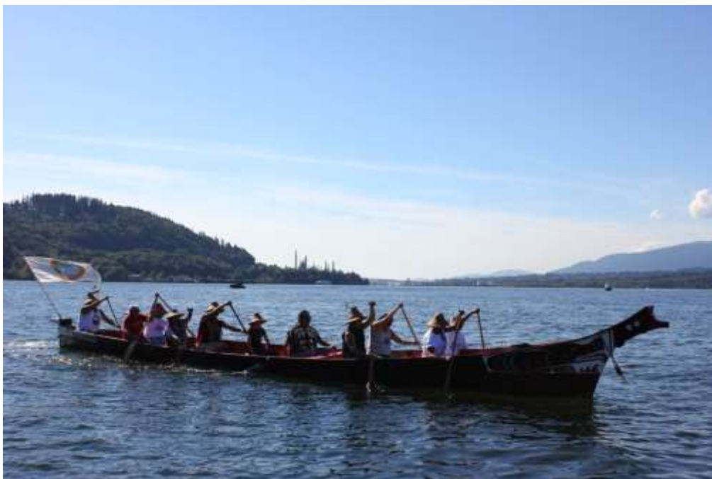
Image 1 Squamish Ocean-Going Canoe

Lacrosse - The game of Lacrosse has a long history in the Squamish Nation. The book Teiointsikwaeks , states: “The People of the Squamish Nation have been playing their own version