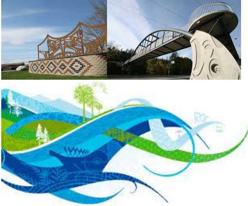
Figure 5 Xwalactun Art

Squamish Sports - In terms of sport, the Nation has a rich canoe history, as well as traditional games, soccer and lacrosse. More recently, the Nation is very proud to host and support the First Nations Snowboard Team.