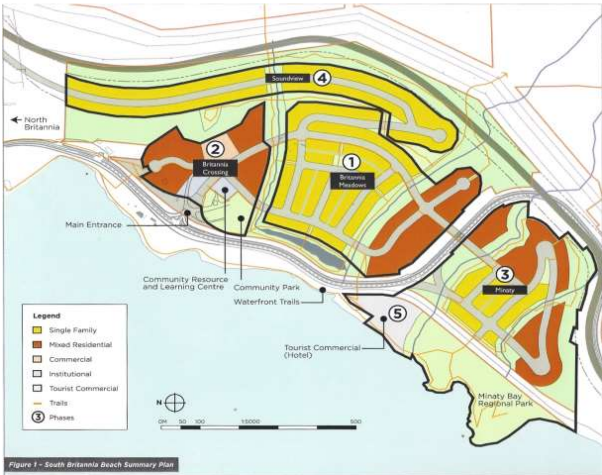
Figure 2 South Britannia Beach Summary Plan (November 2014)

community design workshop held from April 22 nd to April 25 th , 2014 at the Britannia Beach Community Hall. The workshop and associated events were well received and there was strong support for the proposed plan directions as voiced by the participants and further evidenced in the comment sheets at the presentation on the final day of the workshop. The continuing importance of community and corridor partnerships was emphasized throughout the workshop events as noted by the comments and workshops. Posters were displayed on the walls during the whole four days and people were encouraged to provide comments on the draft goals and desired outcomes for the community. Participants wrote comments on sticky notes, which were then incorporated into the revised goals and desired outcomes (Turje, 2014 ).