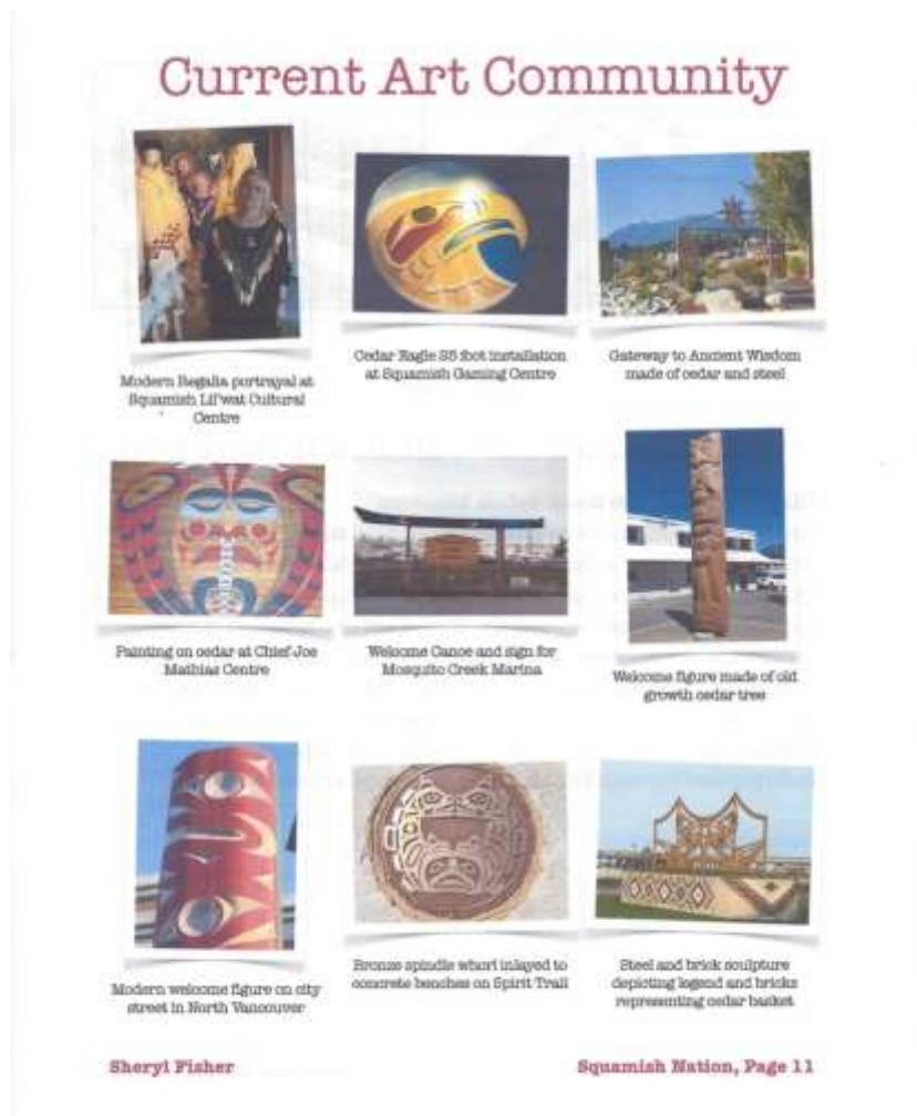
Figure 6 Squamish Nation Art Rivers Consulting Solutions Report