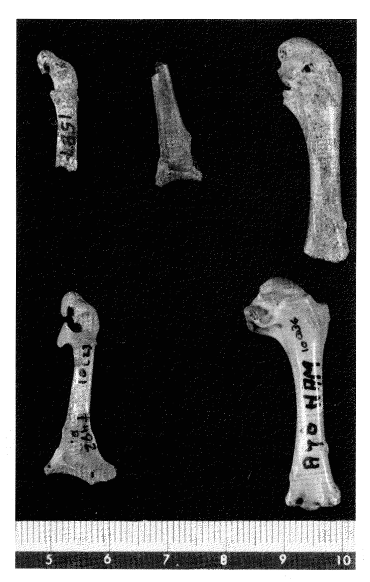
FIG. 2. Specimens of Passenger Pigeon. Top: two coracoids and a humerus from Charlie Lake Cave. Bottom: coracoid and humerus from late prehistoric sites in Ontario.

studied, coupled with their regular appearance in faunal assemblages from at least 8000 B.P., suggests that Passenger Pigeon was a relatively common summer visitor to the area.