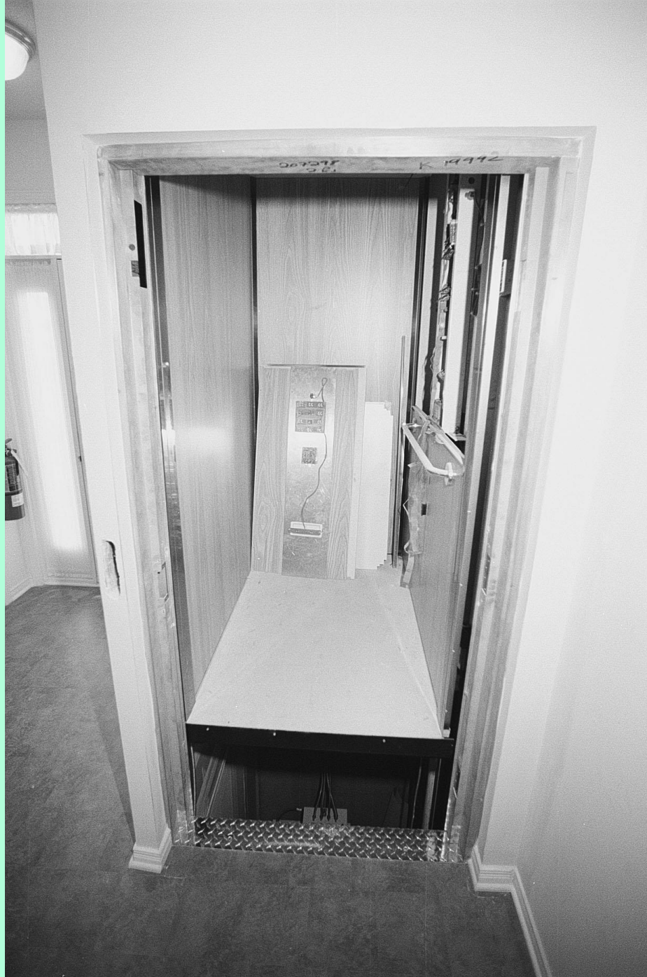
W/C lift In Entry