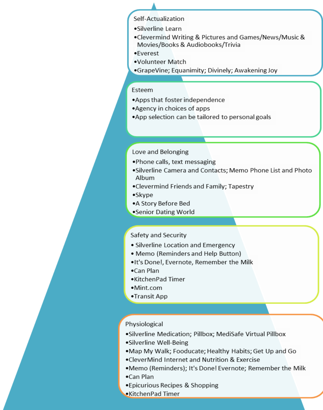
Figure 2.2. Smartphone Applications with Potential Relevancy for Older Adults with Mild Impairments in Cognition as Framed in Maslow's Hierarchy