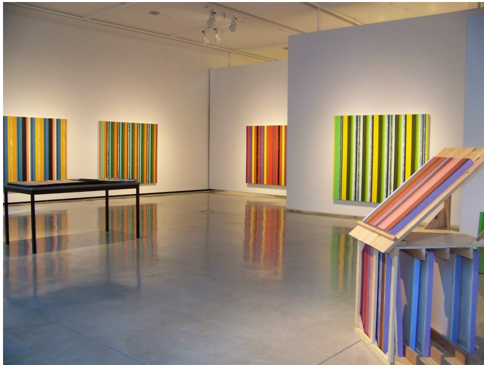
Image 1. Installation in the Audain Gallery