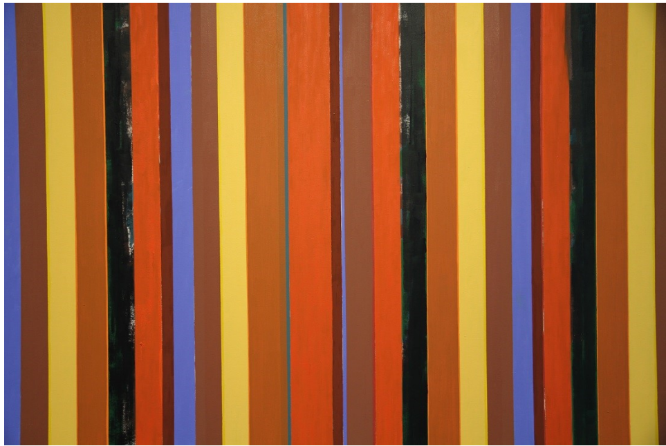
Image 7. 157 Hammersmith One o'clock Jump detail