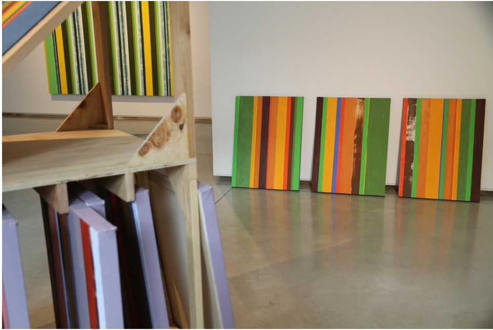
Image 10. Three Small Paintings