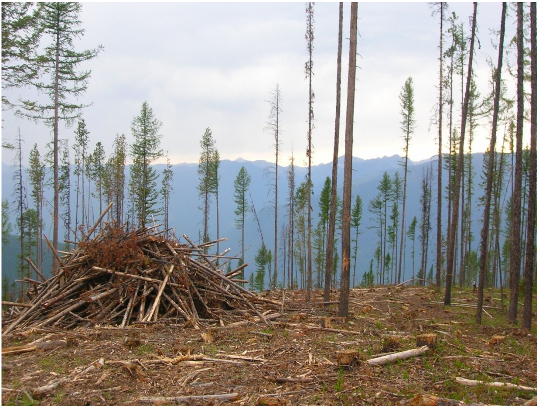
Figure 2: A controversial cut block in the Harrop-Procter Community Forest

community forest staff originally designed the block to act as a wildfire break between two watersheds, and are refraining from completely restocking the area in order to maintain that function. Forest staff also noted that harvests in this block present the lowest risk to water quality of all previous blocks in the community forest because the area is on top of a ridge, on dry bedrock, and far away from any watercourse. Therefore, some respondents' perceptions of the threat this block poses to ecological health in the community forest may be exaggerated.