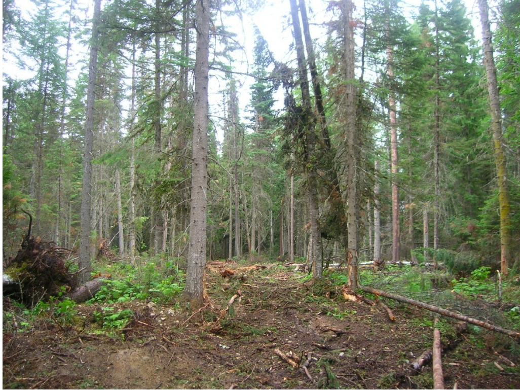
Figure 3: "Pick and poke" harvesting for special forest products in the McBride Community Forest

According to the requirements of the Forest and Range Practices Act , (S.B.C. 2002, c. 69), small harvests under this type of permit are not required to have an associated site plan. Usually, site plans formally identify the area that will be harvested, set allowable site disturbance levels, and describe how the licensee will meet provincial environmental management expectations. In interviews, some 'footprint' residents shared their concern that, without this important level of planning, MCF is not adequately meeting its responsibilities with regard to providing guidance to contract loggers, and to maintaining a reliable record of activities on the timber harvesting land base. This is especially worrisome for domestic water users, who understandably see drinking