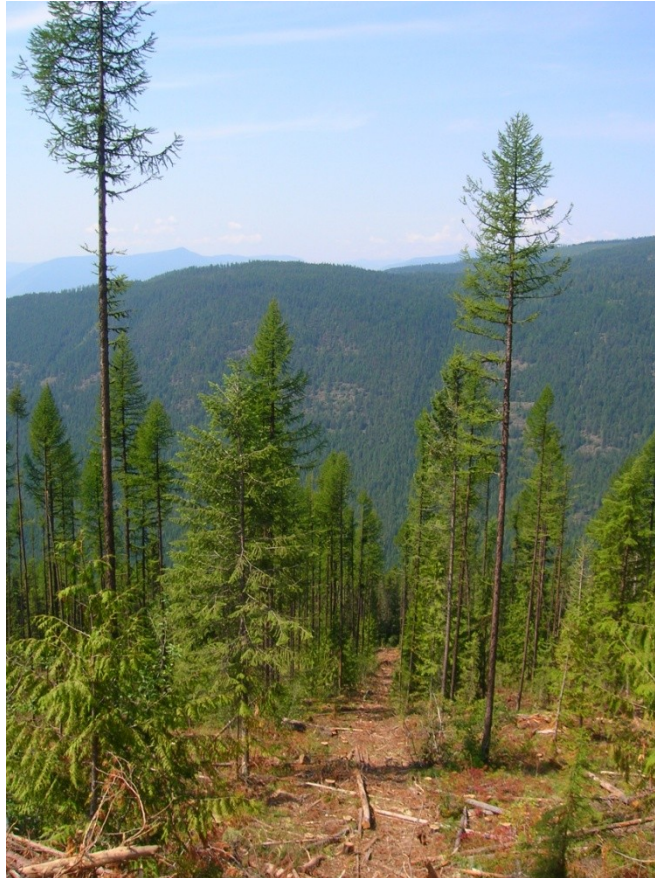
Figure 4: A cable-logged area in the Creston Community Forest

conditions are also preferred for many harvests, as they allow for minimal site disturbance. More recently, CCF has prescribed some clear cuts with reserves in order to remove large stands of beetle-killed timber.