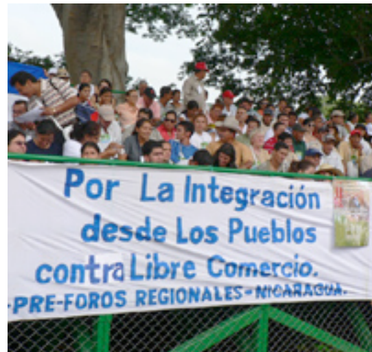
Signs of protest against the Central American Free Trade Agreement (CAFTA) are also signs of different visions of how the region should ‘combine’ its development for the least unevenness. The photo on the left suggests community autonomy, while the sign on the left calls for ‘integration from the communities’.