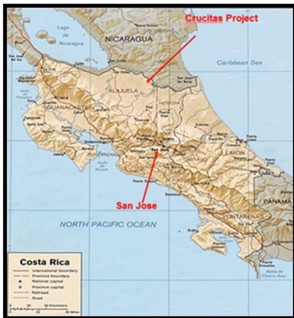
Figure 3. Map of Costa Rica.

The Crucitas region is in the Alajuela Province, Canton San Carlos, in the District of Cutris. It is 95 km north of Ciudad Quesada and 20 km northeast of Coope Vega community (Isla, 2002). The proposed gold mine site is located approximately seven kilometres from the San Juan River, which is the natural northern border between Costa Rica and Nicaragua (World Rainforest Movement, 2008), and is the most extensive watershed in Central America (Walker, 1997).