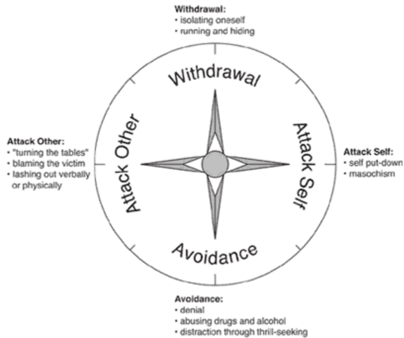
Figure 1 The Compass of Shame