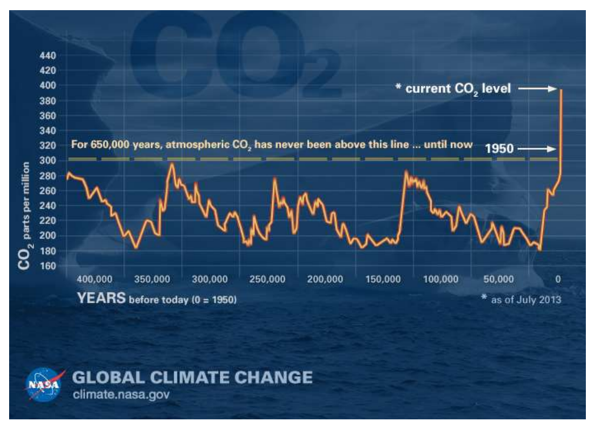
Figure 4 Carbon Dioxide Over the Centuries<sup>120</sup>

Morality binds and blinds. It binds us into ideological teams that fight each other as though the fate of the world depended on our side winning each battle. It blinds us to the fact that each team is composed of good people who have something important to say.<sup>121</sup>