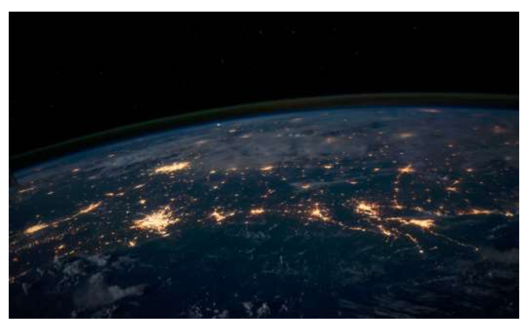
Figure 2 NASA Earth Photo<sup>6</sup>

Over one hundred years ago, Swedish scientist Svante Arrhenius asked if the mean temperature of the ground was in any way influenced by heat-absorbing gases in the atmosphere. He went on to become the first person to investigate the effect that doubling atmospheric carbon dioxide would have on our global climate. This question was debated throughout the early part of the 20th century, and it remains a growing concern today as our weather becomes more extreme due to climate change and litigation emerges within judicial systems wanting to determine who is responsible. Regardless, the amount of carbon dioxide that has increased since the industrial revolution and exponentially in the 20th century has had a dramatic impact on our climate, making it increasingly difficult for humans and our natural world to adapt in what some now believe is an apocalyptic scenario. While the end of our civilisation may seem