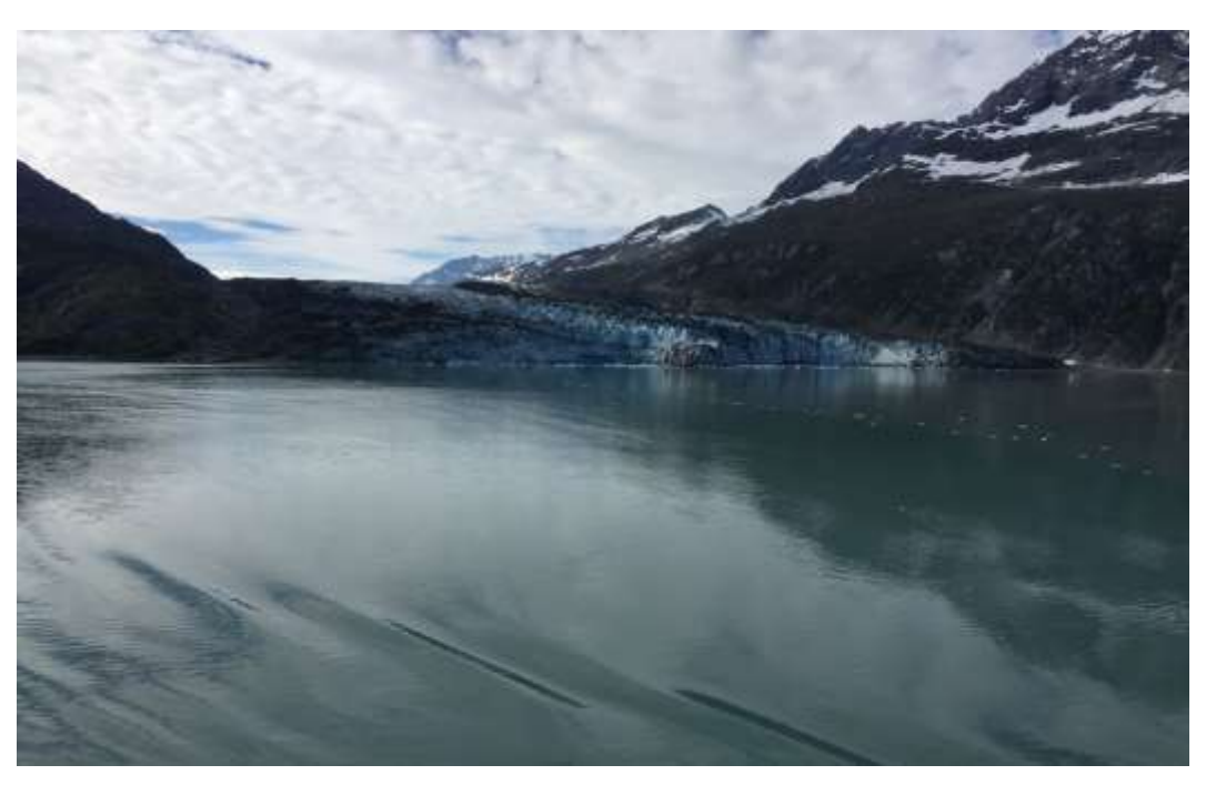
Figure 5 Glacier National Park 122

The science is clear with the growing body of literature and volumes of research regarding the threats to life on our planet. While climate change is not our only issue, it has certainly become a priority in recent years due to its accelerating path of destruction. Global warming is increasing the frequency and intensity of some types of extreme weather and causing more rain to fall in heavy downpours. There are also longer dry periods between rainfalls. This, coupled with more evaporation due to higher temperatures, intensifies drought. Wet places have become wetter, while dry places have become drier. Heat waves have become more frequent and intense, while very cold days have decreased. Still, for all the global attention this topic has received, many people aren't convinced that it's real or a problem. Even for the many who recognise that climate change is real, they do very little to stop it. What then is the