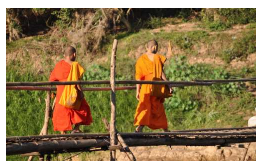
Figure 6 Monks in Luang Prabang<sup>164</sup>

Perhaps religion offers us a transition or escape from our shadow or those darker moments where we are reluctant to have those difficult conversations about those messy bits about ourselves. Yuval Noah Harari writes in Homo Deus: "Generations of humans have prayed to every god, angel and saint, and have invented countless tools, institutions and social systems, but they continued to die in their millions from starvation, epidemics and violence." For people of faith, it would seem challenging wondering where God went when contemplating these frailties and the shadow side of humanity. Or how God and religion fit in at this chaotic time in history. In one of George Carlin's more memorable monologues, he discusses God from a Judeo-Christian perspective: