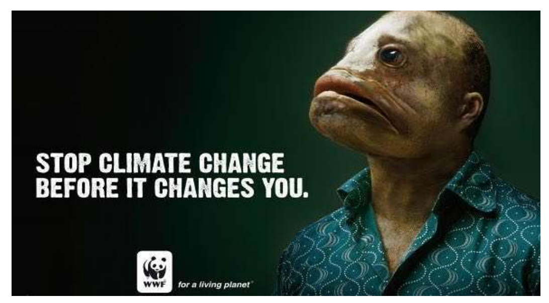
Figure 3 WWF Graphic 64

For centuries storytellers, academics, and scientists have written about the world we live in as well as the political and social revolutions that have come with it. They have written volumes about the beauty of nature as well as our interconnectedness with it. In the last few decades, there is more pivotal writing about over-consumption, damage to our environment and how we are destroying our planet at an alarming rate. If growing populations of humans on our planet that can't produce enough to support themselves wasn't the first clue, the fact that natural habitats are being destroyed and that we have poisoned every stream, river and ocean, wildlife, and even ourselves with dangerous pesticides and chemicals should be a wakeup call. Scientists point out that it took hundreds of millions of years to produce life on our planet and with the rapidity of change and humanity's recklessness in the mere one hundred thousand years since we walked out of Africa, we seem to be racing to our end. As Mayer Hillman suggested earlier, while the planet may be fine in the long run, existing life as we know it is at risk.