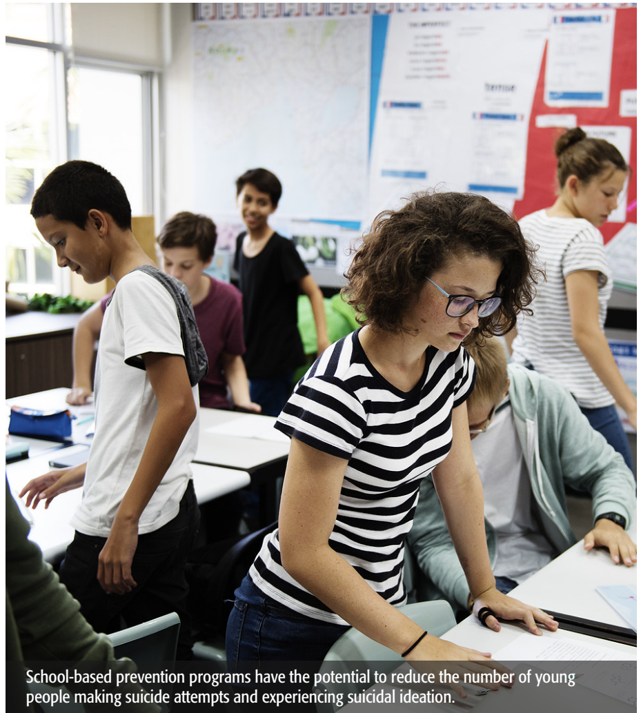
School-based prevention programs have the potential to reduce the number of young people making suicide attempts and experiencing suicidal ideation.

Aussie Optimism aimed to prevent anxiety, depression and suicide through a school-based program. 13 Two versions were assessed — regular and enhanced — for children in Grades 6 and 7, over two school years. For both, teachers provided lessons based on cognitive-behavioural therapy. Students in Grade 6 received