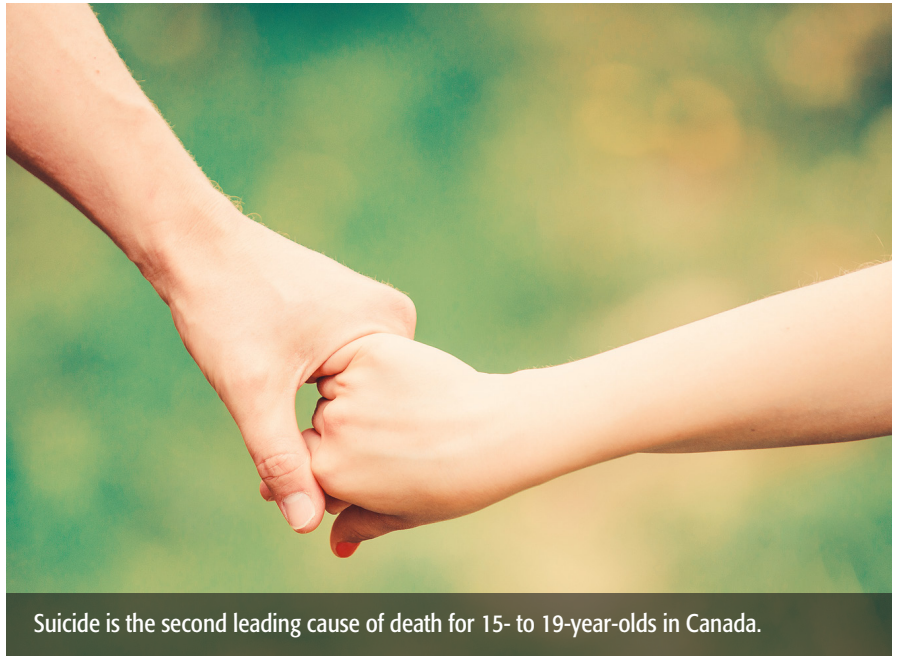
Suicide is the second leading cause of death for 15- to 19-year-olds in Canada.

As well as suicide deaths, attempts are another serious concern. In Canada, much was learned from the National Longitudinal Survey of Children and Youth, which followed a representative sample of young people for more than a decade. 6 Importantly, most young people (96.0%) had never attempted suicide. But among the 4.0% who did make an attempt, researchers found clear patterns. For half of these young people, attempts