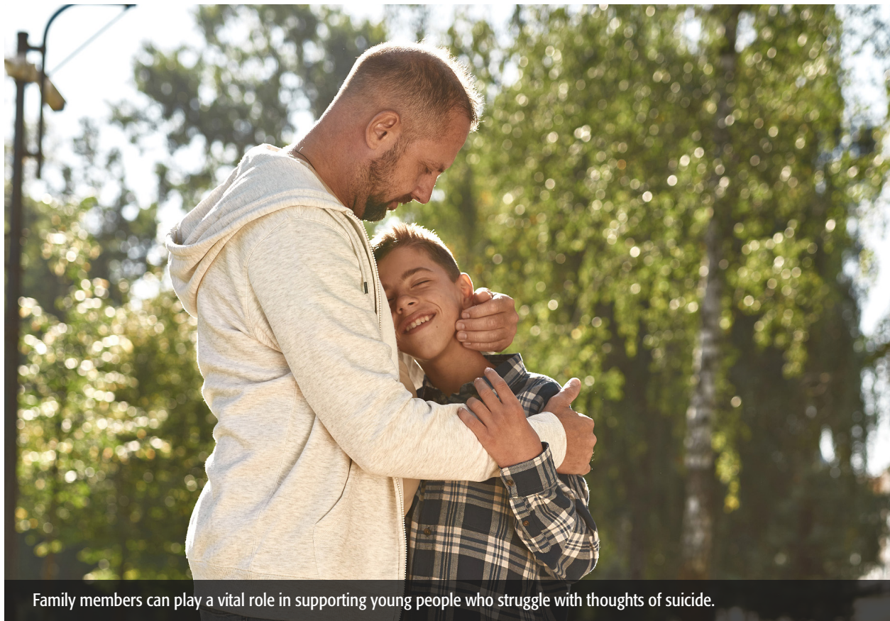
Family members can play a vital role in supporting young people who struggle with thoughts of suicide.

Efforts to reduce suicide should ideally involve reaching as many young people as possible using effective universal interventions.