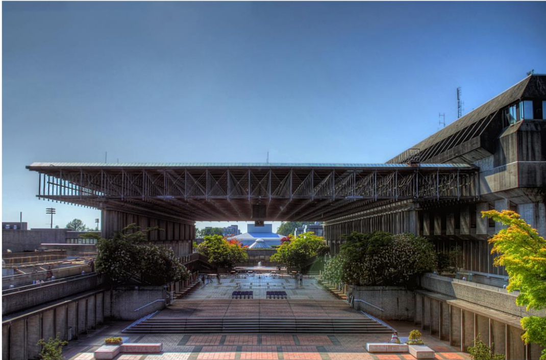
Figure 1.1-1: Convocation Mall as viewed from the Academic Quadrangle