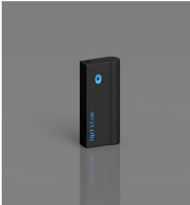
Figure 2.1 - OptiCue Concept 3D Model

OptiCue is a small wearable device used to detect facial expressions and alert the user when the other parties facial expression changes. The OptiCue is designed for those with disorders, such as autism, which prevent them from recognizing emotion and social cues, a condition known as alexithymia. With the proper training, especially at a young age, people suffering from alexithymia can learn to recognize certain facial expressions. It is our goal to provide a small, low-cost, and easy-to-use device to aid people with alexithymia in their social endeavors.