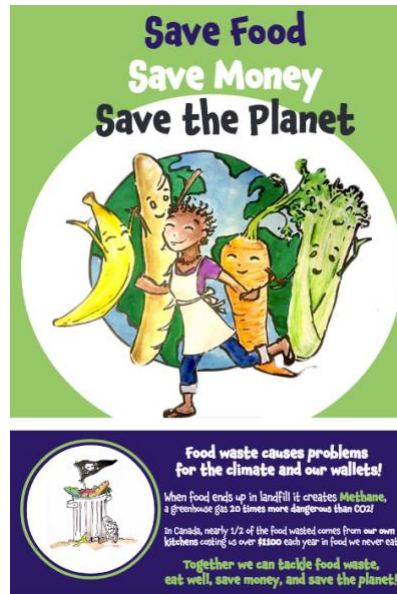
Figure 1: Save Food, Save Money, Save the Planet Booklet

consumer awareness and motivation and hopefully make individuals turn toward positive change.