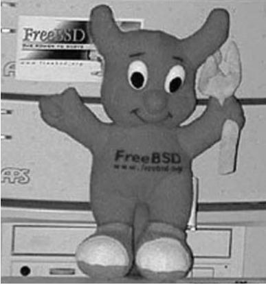
Figure 2. FreeBSD mascot.

So why are these daemons called “send mail” and not Satan? Most simply, a daemon is a process that runs in the background without intervention by the user (usually initiated at boot time). They can run continuously, or in response to a particular event or condition (for instance, network traffic), or at a scheduled time (e.g., every five minutes, or at 05:00 every day). More technically, UNIX daemons are parentless—that is, orphaned—processes that run in the root directory. You can create a UNIX demon by forking a child process and then having the parent process exit, so that INIT (the daemons of daemons) takes over as the parent process. 55